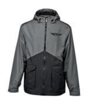
Good Windbreaker 2014 Fly Racing Pit Jacket