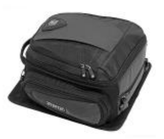
Good Tail Bag OGIO Tail Bag