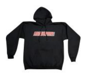
Good Sweater/Pullover MotoSport Hoody