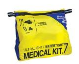
Best First Aid Kit Klim Ultralight Watertight First RotopaX First Aid+Preparedness