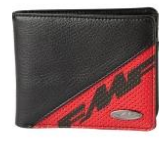
Better Wallet Best Wallet Icon Leather Wallet