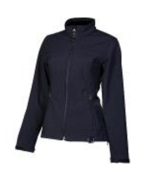
Best Windbreaker 2013 Klim Women's Whistler Jacket