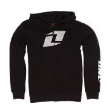
Better Sweater/Pullover One Industries Icon FZ Hooded Fleece Jacket