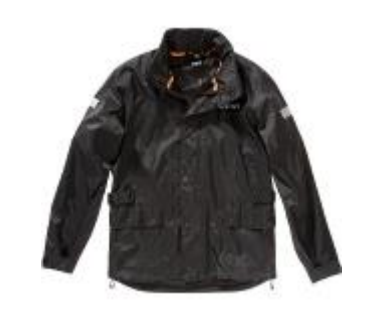
Better Packable Rain Gear REV'IT! Nitric H2O Rain Jacket