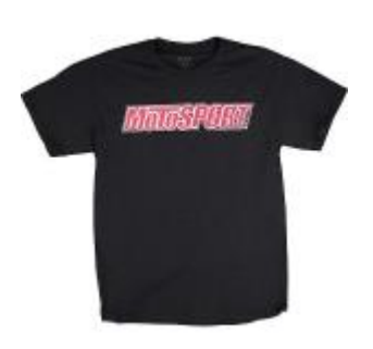
Good Shirts MotoSport Logo T-Shirt