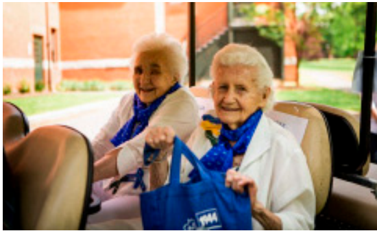
Class of 1944