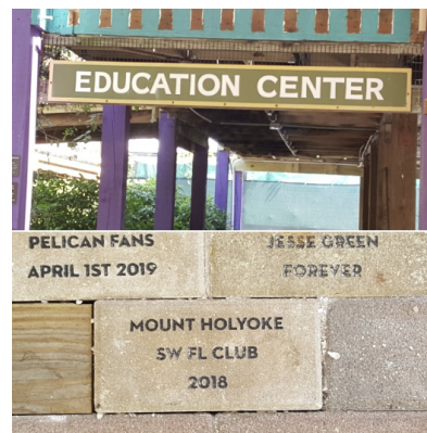
Our Brick at SOS