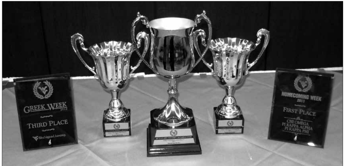
(L to R): Greek Week 2012 Third Place; Outstanding Leadership, 2011; Joe Gluck Award, Best Fraternity on Campus 2011; Outstanding Fraternity Philanthropy 2011; Homecoming Week 2011, First Place

Not only did WVU honor the chapter, the University also recognized more than 20 individual members with academic awards.