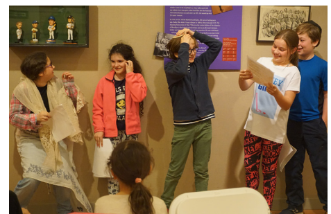
Hebrew School students ended the year on a great note at our Hebrew School siyum. Students presented on what they learned this year with songs, skits and more!