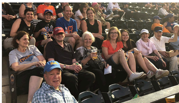
OZers had a great time at the Mets game! Despite the Mets' loss, everyone enjoyed the kosher hotdogs, beautiful weather and great company!