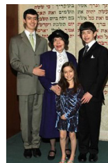
Above: The author with her grandchildren

her young students hope and the power of love. Each of the 35 poems is accompanied by an illustration, one of which is replicated below. The book is available at Amazon at the following link: https://tinyurl.com/ThinkFeelAm .