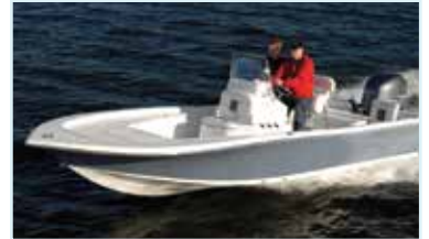
2200 CAROLINA BAY