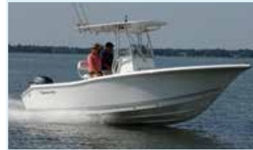
216 CC ADVENTURE