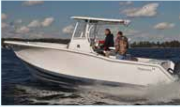
280 CC ADVENTURE