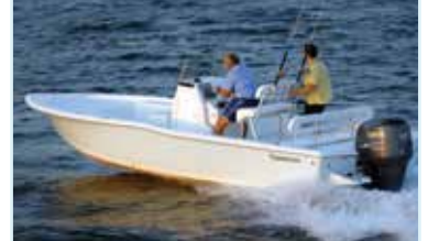
2400 BAY MAX