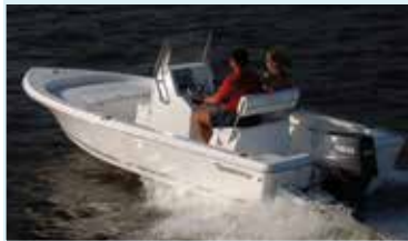
1800 BAY MAX