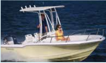
180 CC ADVENTURE