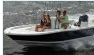
2000 CAROLINA BAY