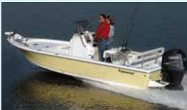
2100 BAY MAX