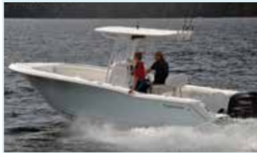
230 CC ADVENTURE