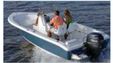
196 CC ADVENTURE