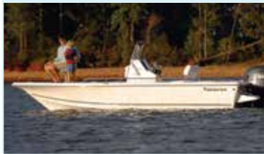
1900 BAY MAX