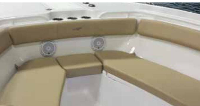
OPTIONAL TAN INTERIOR

Livewell (2) 20 Gal. ea Aft Cockpick Depth :: 27" Midship Depth :: 33" Bow Depth :: 35" Capacity :: 12 ppl/2200 lbs.