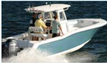
250 CC ADVENTURE