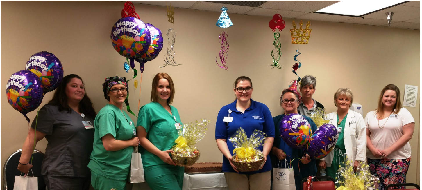
MARCH CELEBRATION: McAlester Regional Health Center employees are treated to a luncheon party for their birthday month. Look for your invitation from Human Resources! Pictured are employees at the March celebration. Happy Birthday!