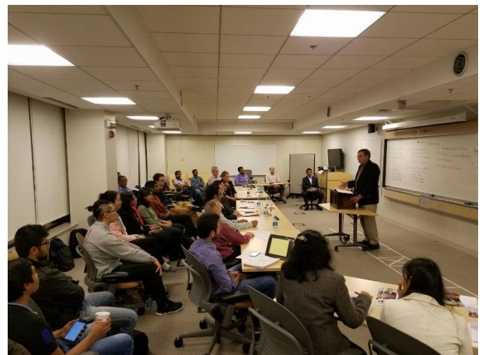
One of the Toastmasters sessions