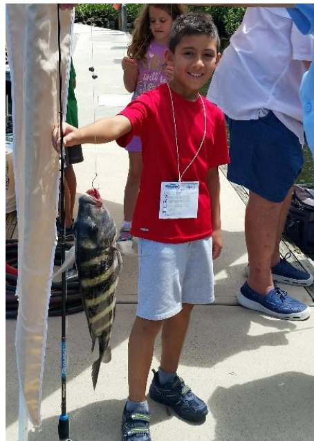
Clinic Lessons Put To Work