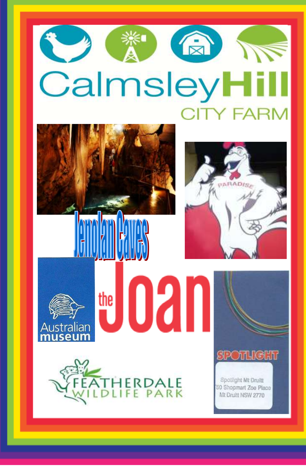
Please support our local businesses, they are sponsoring our Sportathon with prizes for our students