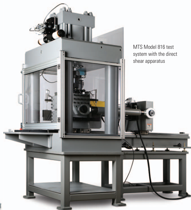
MTS Model 816 test system with the direct shear apparatus