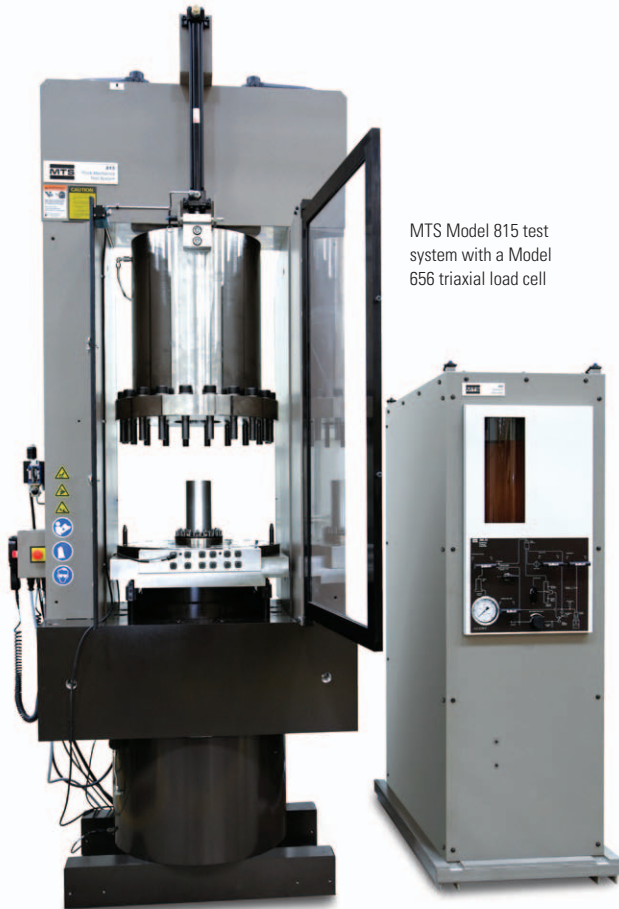
MTS Model 815 test system with a Model 656 triaxial load cell

The MTS Model 815 and 816 test systems include a number of features that help test professionals perform a wider variety of tests with a single system. Spacer plates allow you to choose from a range of specimen sizes. Load frames are pre-engineered for installation of triaxial cells. Other accessories are designed for easy installation in multiple configurations, depending on your needs. Plus, MTS can customize either system to accommodate unique requirements.