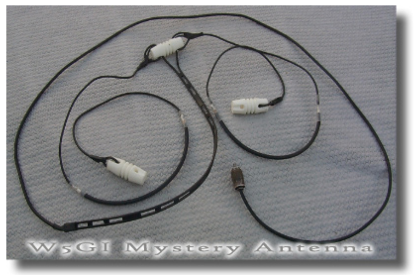
Photo A - Full view of the W5GI multi-band Mystery Antenna with all sections shortened considerably for illustration purposes.

Builders of the Mystery antenna will need the following materials: