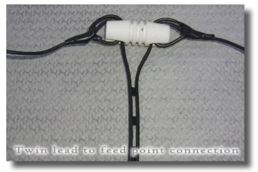
Photo D - Connection of twin lead to inner antenna wires at center of antenna.