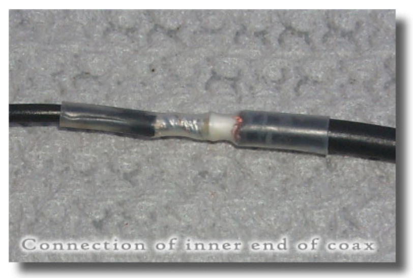
Photo B - Connection of inner end of coax section (closer to center). Note that only the center conductor is connected to the wire.

11. Install the antenna with the center conductor at least 25 feet high. Mine is installed in a horizontal plane; however, others have installed the 'GI antenna as an inverted-vee and are getting excellent results.