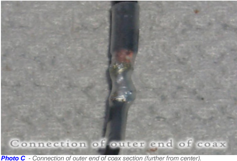
Photo C - Connection of outer end of coax section (further from center, Note that both center conductor and shield are connected to the wire.