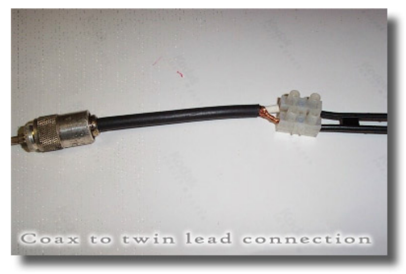
Photo E - Connection of twin lead to coax. Short length of coax section is for illustration purposes only. All connections should be weatherproofed with shrink-tubing, CoaxSeal, or similar.

Table 1 below depicts the typical SWR results for the W5GI multi-band antenna: