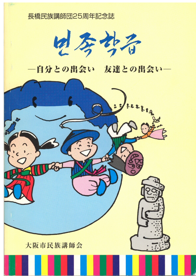
Booklet celebrating the 25th anniversary of the association of Korean instructors in Nagahashi

influential in shaping the content of ethnic education in Osaka City.