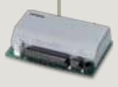
Terminal Equipment Controllers (TEC)