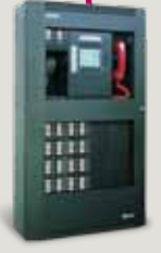
Fire Alarm Panel