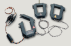
Digital Energy Monitor (DEM)