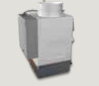
Lab Room Controller Factory-Mounted on Terminal Unit