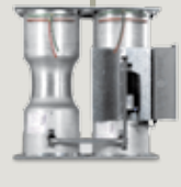
Lab Room Controller Factory-Mounted on Venturi Air Valve