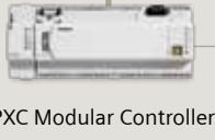
PXC Modular Controller