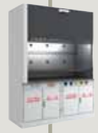
Fume Hood Monitor