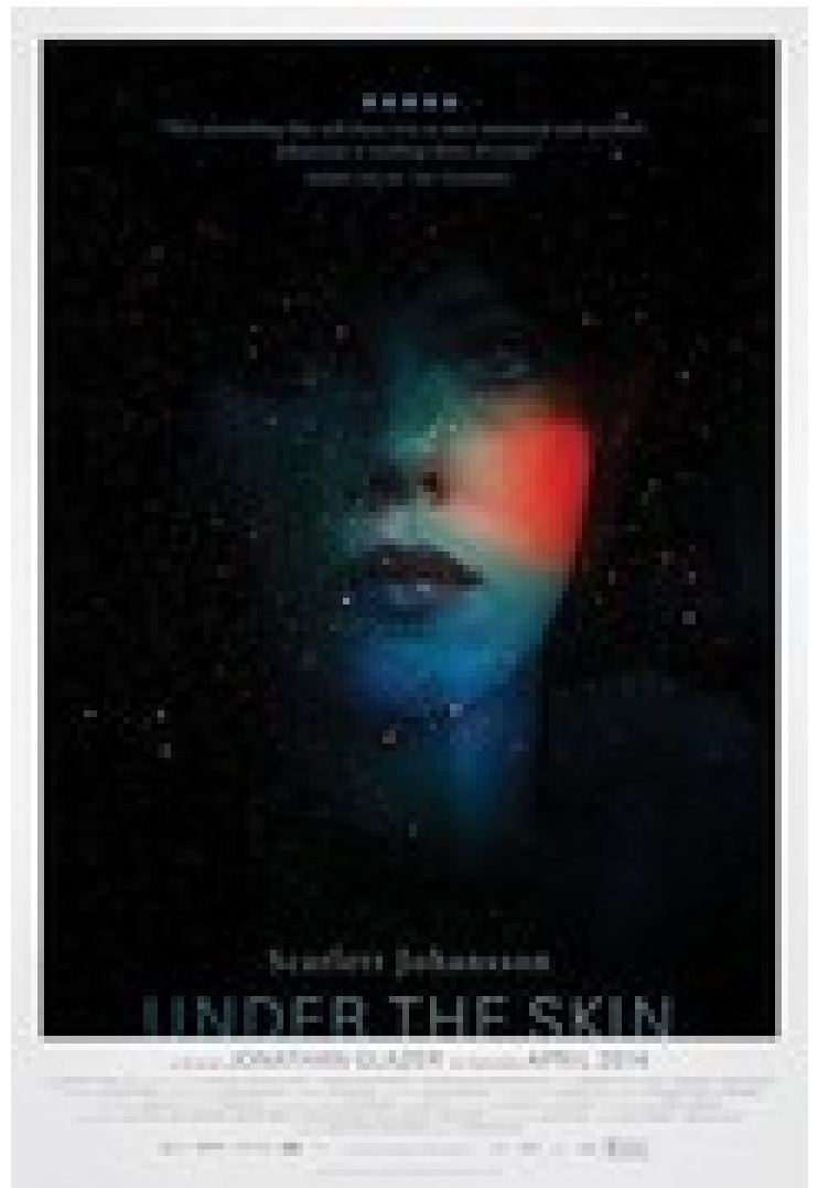
Under the Skin ★ ★ ★ ★