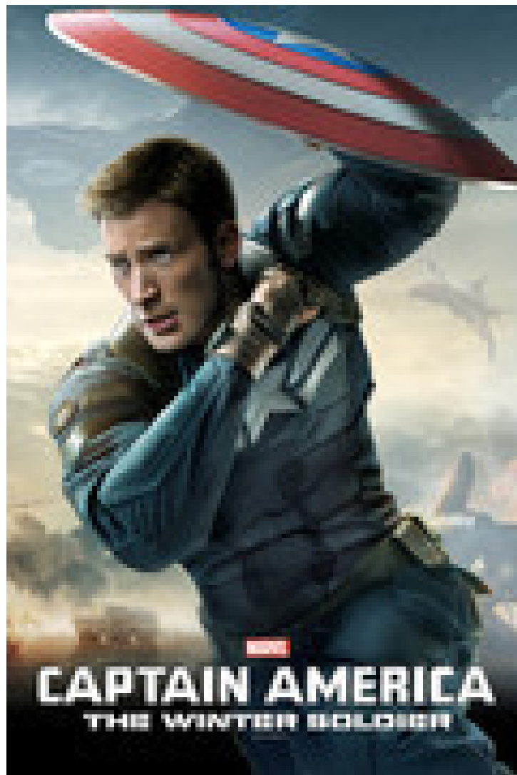
Captain America: The Winter Soldier