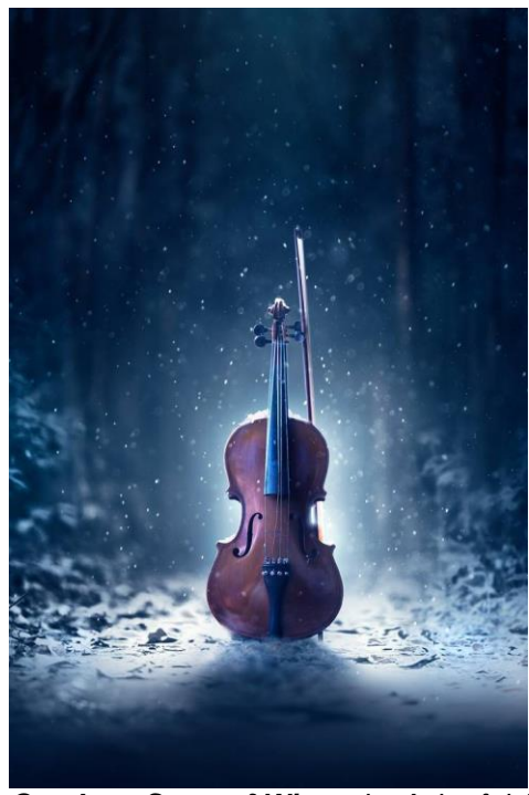
One Last Song of Winter by Ashraful Arefin (Bangledesh)