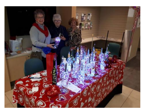
Our first Venue for 2020 and Valentines Theme

We are encouraging everyone to volunteer just to become familiar with how it all works at KGH. A chance to work with the square is important. I am getting my old phone cleaned off and will donate it to Rotary so that we have a phone available to couple with the square.