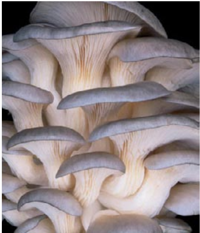
Gray Oyster Mushrooms • Glen Babcock – Garden City Fungi

Small-scale mushroom production represents an opportunity for farmers interested in an additional enterprise and is a specialty option for farmers without much land. This publication is designed for market gardeners who want to incorporate mushrooms into their systems and for those farmers who want to use mushroom cultivation as a way to extract value from woodlot thinnings and other “waste” materials. Mushroom production can play an important role in managing farm organic wastes when agricultural and food processing by-products