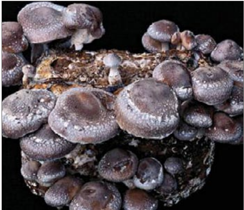
Shiitake mushrooms fruiting on sawdust

The chamber and the steam processor to pasteurize or sterilize the sawdust can represent a significant initial investment. For example, Crop King sells a small mushroom production system, including an inoculation table and bagging station, for about $5,000. The company’s complete growing system—including equipment, structural components, and technical support—can come to more than $41,000. Recovering these costs is a challenge for a beginner—especially at current mushroom prices.