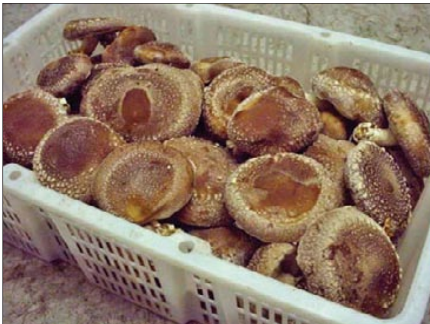
Shiitake mushrooms harvested from sawdust Glen Babcock – Garden City Fungi