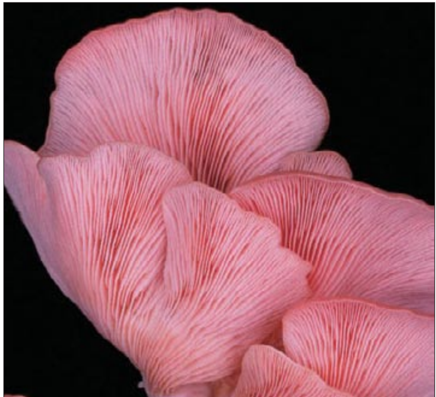
Flamingo Oyster Mushrooms • Glen Babcock – Garden City Fungi

Oyster mushrooms ( Pleurotus species ) are a good choice for beginning mushroom cultivators because they are easier to grow than many of the other species, and they can be grown on a small scale with a moderate initial investment. Although commonly grown on sterile straw from wheat or rice, they will also grow on a wide variety of high-cellulose waste materials. Some of these materials do not require sterilization, only pasteurization, which is less expensive. Another advantage of growing oyster mushrooms is that a high percentage of the substrate converts to fruiting bodies, increasing the potential profitability.