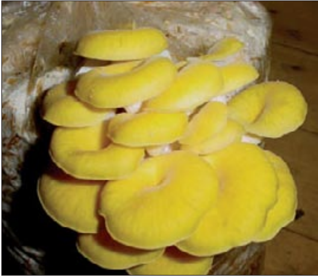
Golden Oyster Mushrooms • Glen Babcock – Garden City Fungi