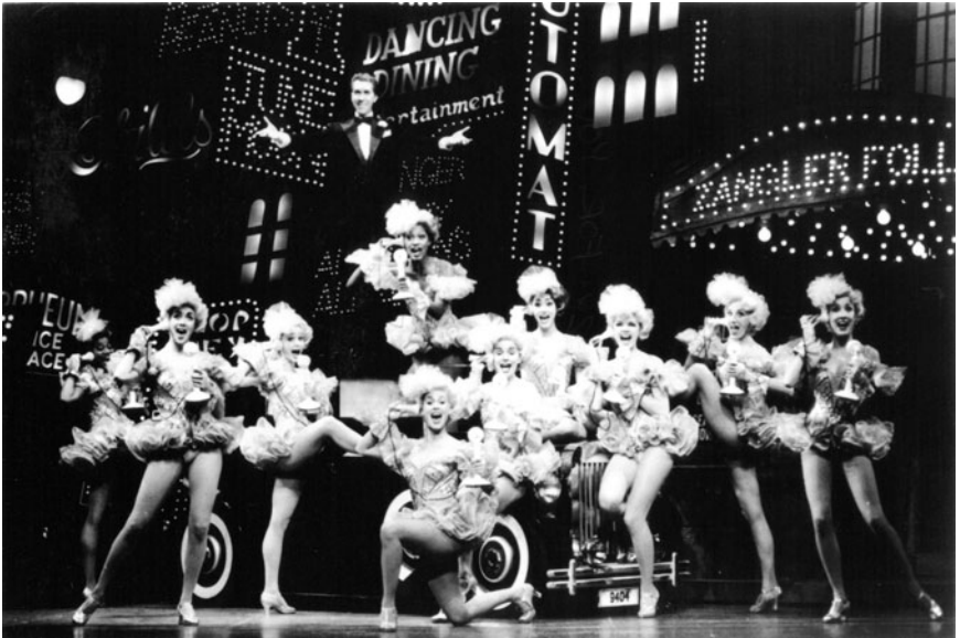
Harry Groener and the ladies of the Crazy for You (1992) ensemble performing “I Can’t Be Bothered Now,” which choreographer Susan Stroman staged as a tribute to the platinum-haired showgirls of the Ziegfeld era. Note the marquee announcing THE ZANGLER FOLLIES. (Author’s collection,)