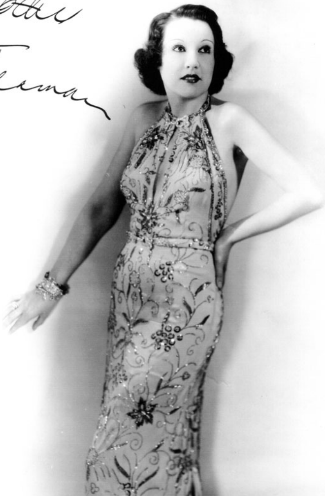
Ethel Merman as she appeared in Red, Hot and Blue (1936). This photo may come as something of a surprise to those who only know her in later years. This former stenographer made good use of her secretarial skills, handling all her own correspondence and maintaining a detailed set of scrapbooks chronicling her entire career—with typewritten captions for each item.