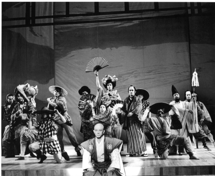
Mako (center) serves as reciter/narrator for Pacific Overtures (1976), leading the ensemble in Sondheim's ode to Japan's once isolated existence, "The Advantages of Floating in the Middle of the Sea." In keeping with Kabuki tradition, the female roles in this opening scene are all played by males.