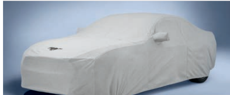
Full vehicle covers 1