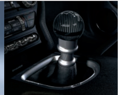
Carbon-fiber gear shift knob