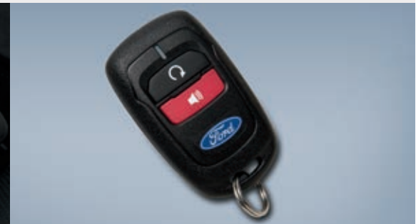
Remote start systems

Shop the complete collection at accessories.ford.com