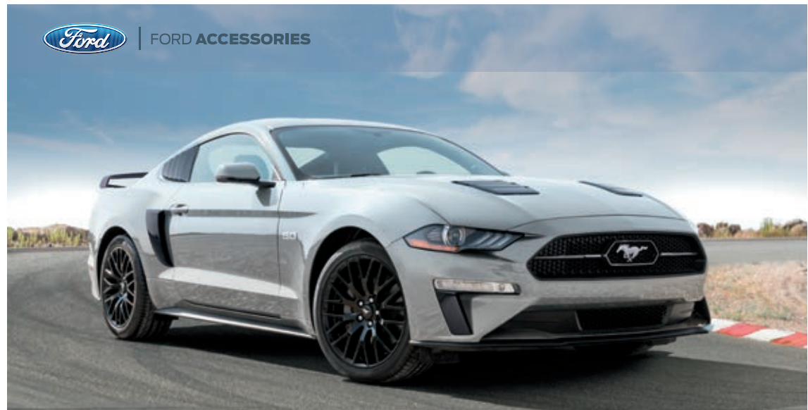
GT Premium in Ingot Silver Metallic accessorized with Performance Package rear spoiler, side and quarter window scoops, 1 hood vents, 1 park lamp curtains, 1 Pony grille insert, wheel center caps, and wheel lock kit