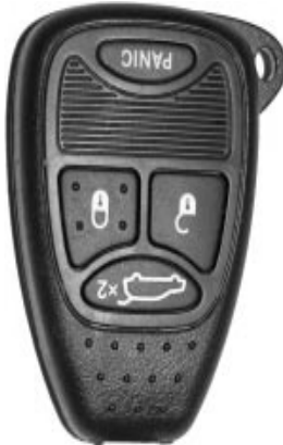
4 BUTTON REMOTE PACIFICA