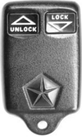
1998 JEEP CHEROKEE