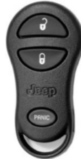
1999-2001 JEEP CHEROKEE