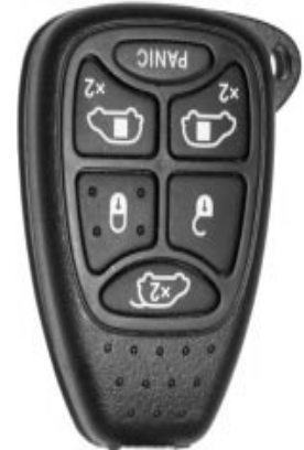
6 BUTTON REMOTE WITH POWER SLIDING DOORS