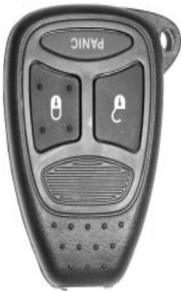
3 BUTTON REMOTE NO POWER SLIDING DOORS