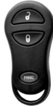
2001-2004 PT CRUISER