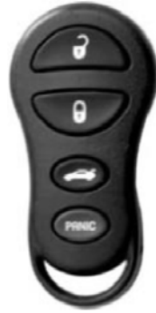
2002-2004 JEEP LIBERTY