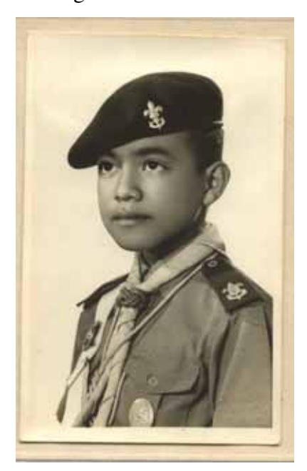
In my Boy Scout uniform, age 14

I went to a Catholic school at the age of six or seven. It had grades through 12, like here in America. At this first school I walked to and from school, which was about a mile. We had lunch there but sometimes my mom would pack our lunches. We started learning English in kindergarten.