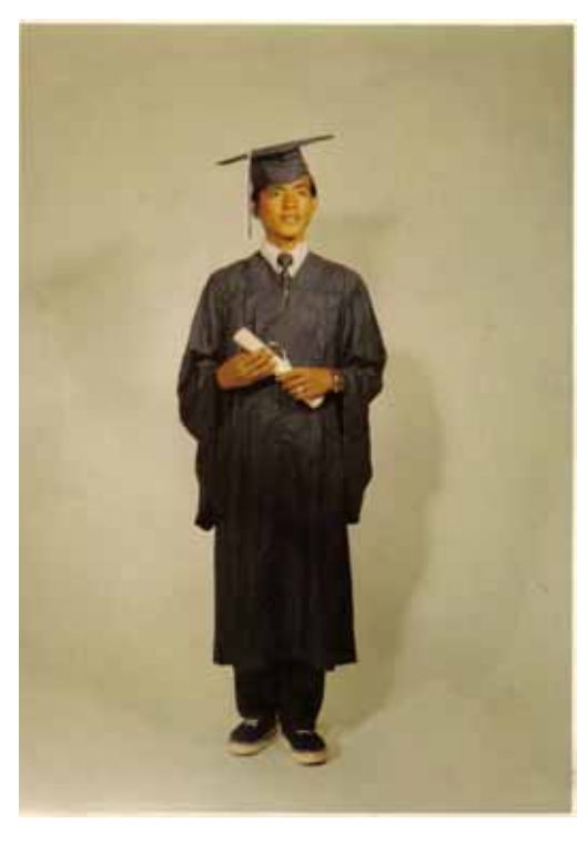
Cambria Adult High School Graduation

After Cambria I went to Compton Junior College in Compton, California. I decided to take a major in