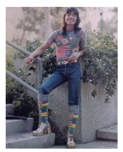
Hippie days in Hollywood, California.

photography and graphic arts since they didn't offer electronics. For a couple of years I contributed photographs and stories to the number one music magazine in Thailand called Impressive Song Hits.