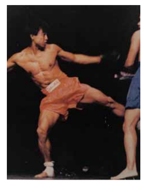
Kickboxing in the U.S.

When we got back to the States I came to Springfield to visit my daughter. A friend hooked me up with a guy who owned the Jamaica's indoor volleyball court, nightclub, and restaurant on Chestnut and Pythian. He offered me a job. I thought, I could go back to the Lodge or be close to my daughter. I took the job.