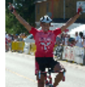
Baptism is not a finishing line

“And do not be conformed to this world, but be transformed by the renewing of your mind , so that you may prove what the will of God is, that which is good and acceptable and perfect.” (Romans 12:2 NASB)