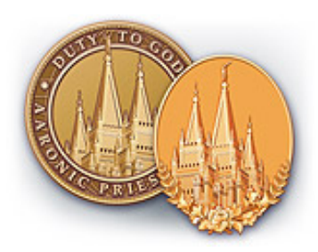
*Please Note: This information was gathered from The Church of Jesus Christ of Latter-day Saints web site. All material is for personal/home use only as it falls under strict copy right laws. For more info see www.lds.org