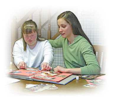
RESPONSIBILITIES OF CLASS PRESIDENCIES P.1