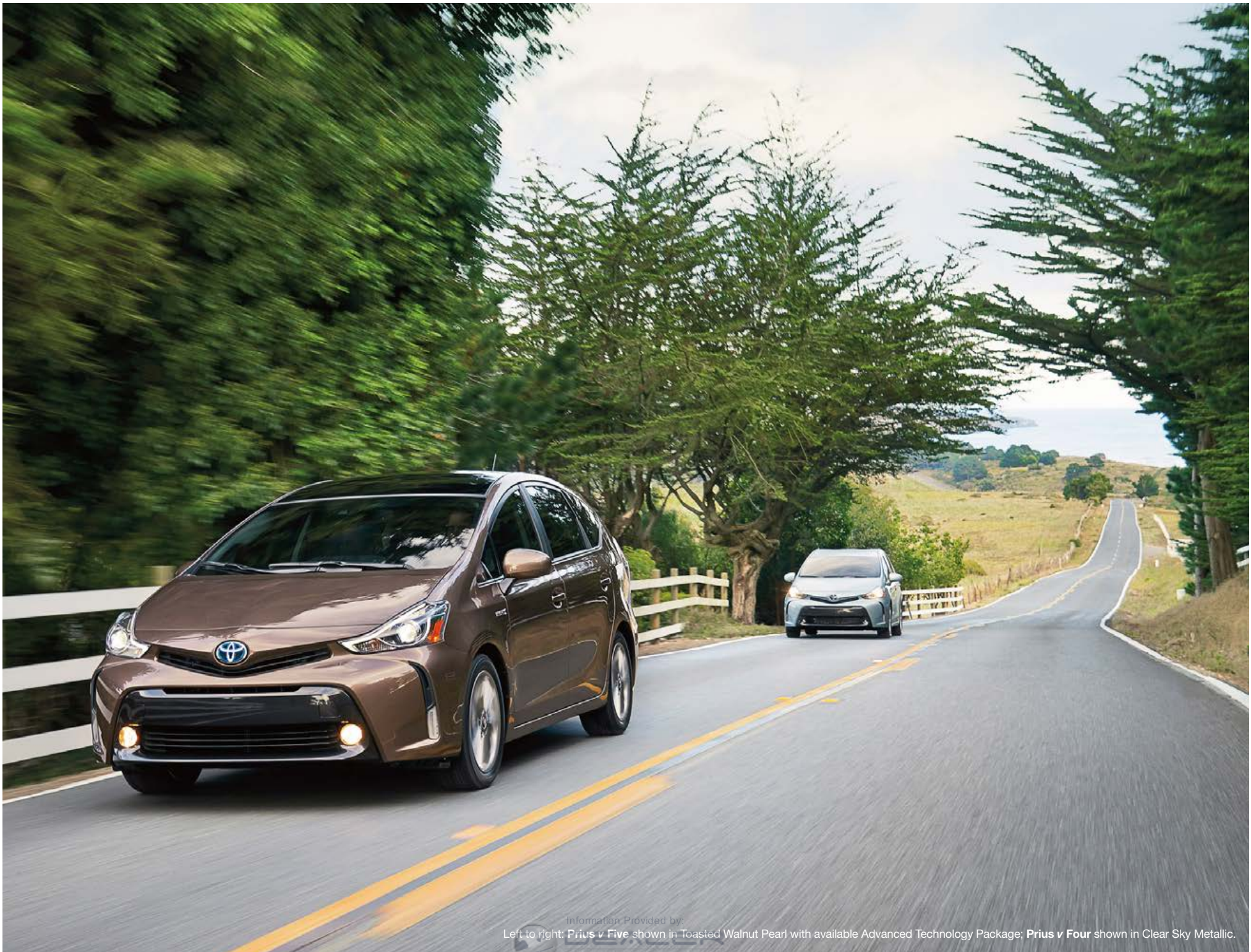
Information Provided by: Left to right: Prius v Five shown in Toasted Walnut Pearl with available Advanced Technology Package; Prius v Four shown in Clear Sky Metallic.