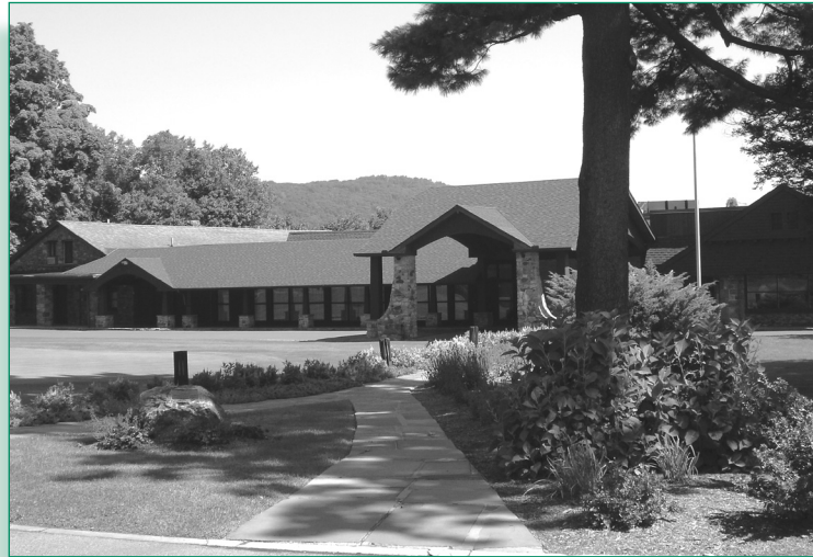
Cover: Dellwood Country Club