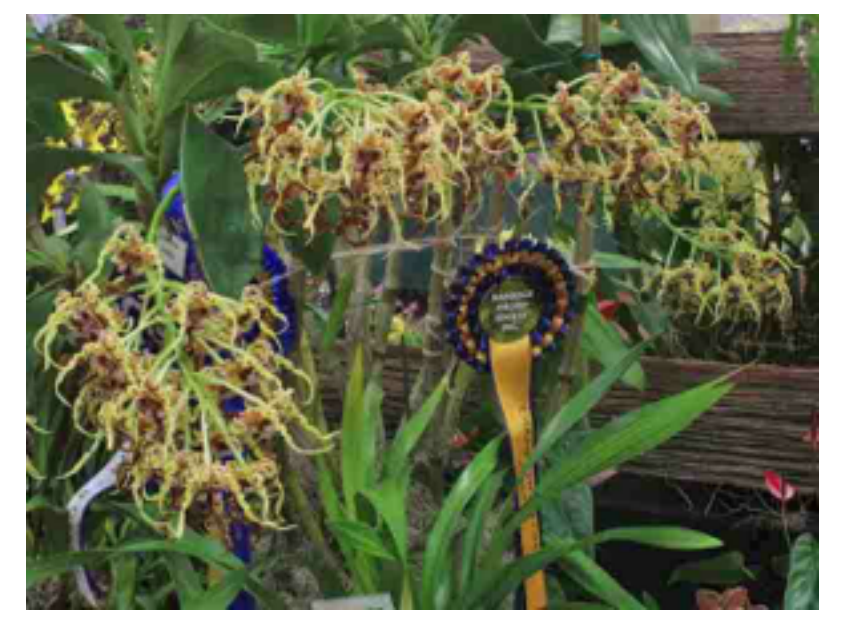
Dendrobium spectabile - Champion of the show