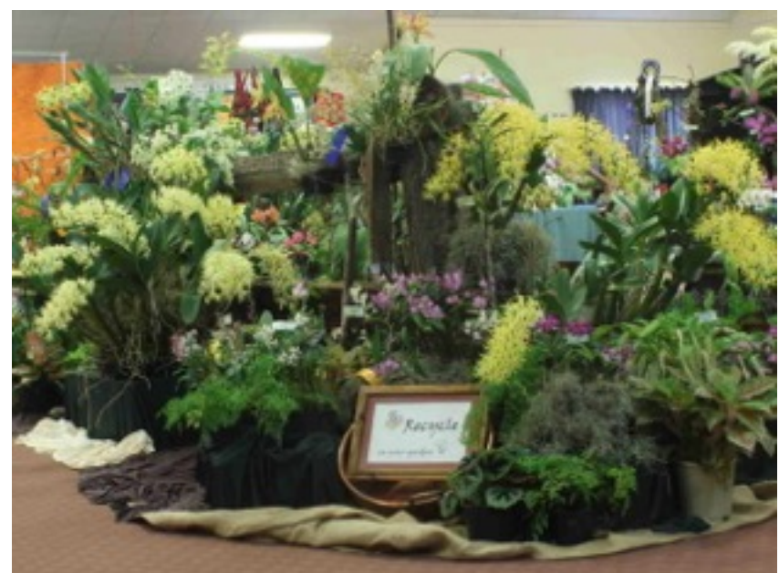
More of the NOS Spring Show