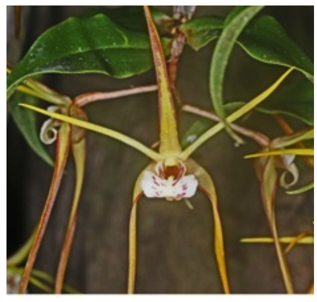
Dendrobium tetragonum var. melaleucophilum