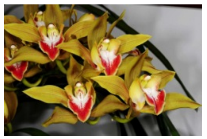
Cymbidium Iowianum var. iansonii