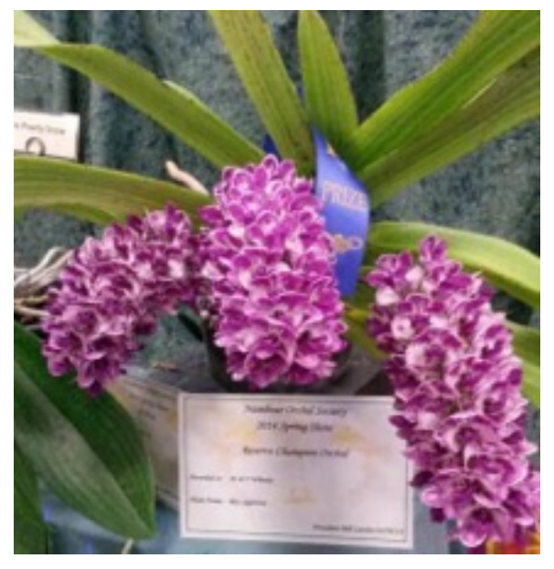
Rhynchostylis gigantea - Reserve Champion