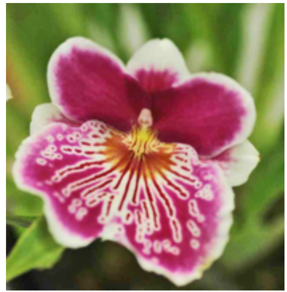
Mps. Lawless Falls