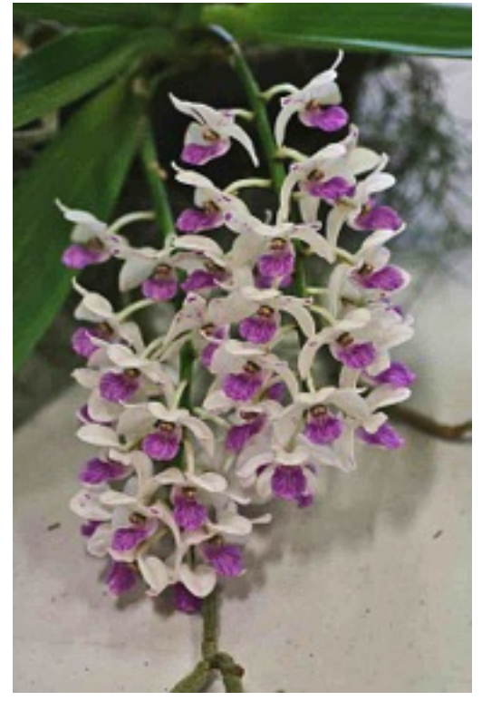
Rhynchostylis gigantea