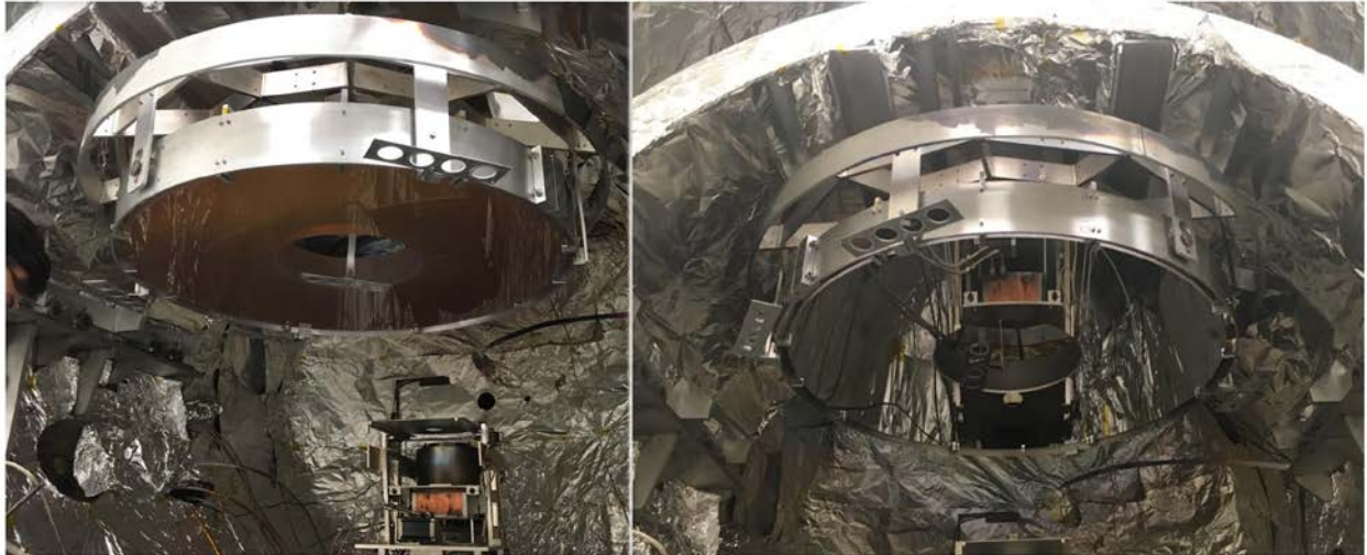
Figure 4: The 1.3-meter, 52-inch 800 lb mirror suspended in the recoating chamber at ZeCoat before coating (left) and after recoating was completed (right).