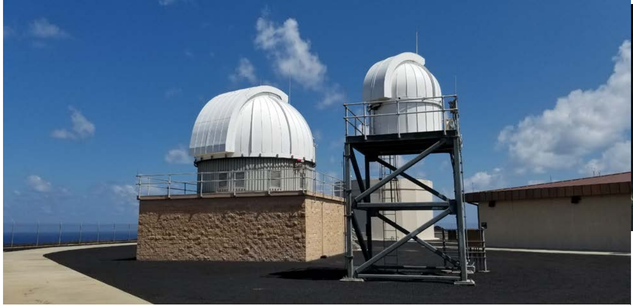
Fig. 1. The John Africano Observatory (JAO) is a joint NASA-AFRL facility that includes: (a) the 1.3-meter MCAT telescope, installed in the larger 7-meter ObservaDome on the left, and (b) a 0.4-meter Officina Stellare telescope that will be installed in the new smaller 2.5-meter dome on the tower platform on the right.

Network (SSN) for the purposes of Space Situational Awareness (SSA). MCAT is expected to make a valuable contribution to our understanding of the orbital debris environment around Earth for years to come.