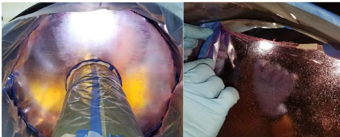
Fig. 5: Cleaning the mirror with First Contact® polymer spray. Left: Primary mirror fully coated. Right: Peeling off the dried polymer.