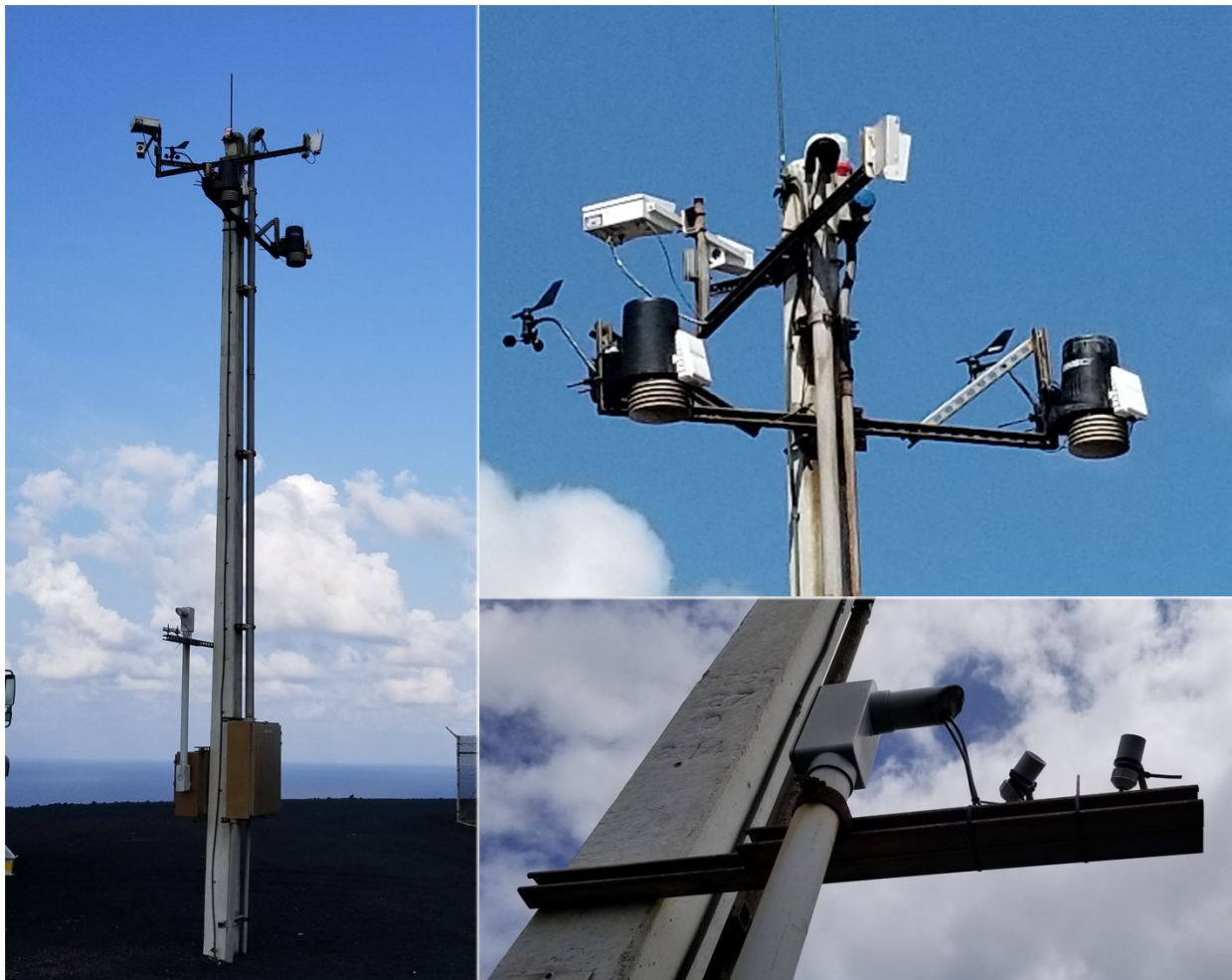
Figure 6: Left: The weather mast is located 75 ft upwind from the observatory. Right/top: The Davis Vantage Pro (black cylinders with anemometers) and one of the OSI rain sensors (above left Davis station) are at the height above ground of the MCAT telescope. Right/bottom: the ASE rain sensors are installed about 1/3 up the mast.

In addition, cloud cover is estimated by a small FLIR infrared camera installed on the spider vein above the secondary mirror, ensuring that the view seen by the MCAT camera is always within the FLIR field of view. The camera estimates opacity of the atmosphere to quantitatively monitor sky transparency conditions when data are taken, necessary for properly calibrating the brightness (photometry) of detected objects. See [2, 4] for more details.