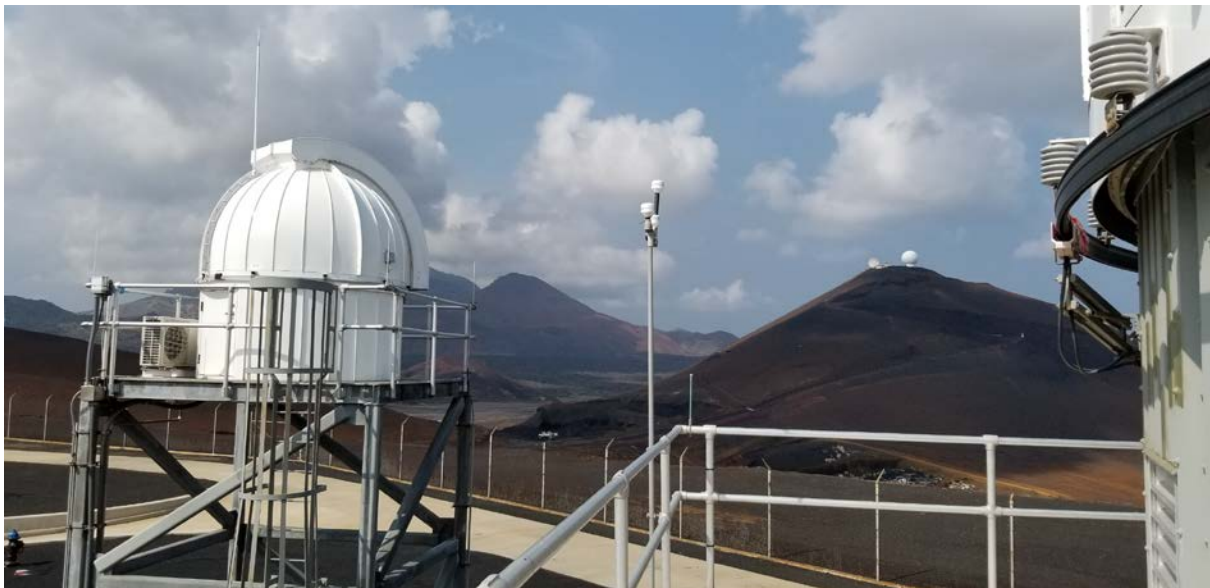
Fig. 1. The new 2.5m ObservaDome, left, installed in August, 2018. Like the 7-meter dome for MCAT, this smaller version is fully capable of fast-tracking debris at all orbital regimes, from LEO to GEO.

Also, an HVAC system was installed to minimize corrosion of the instrumentation inside the little dome when it is closed. Like with the large dome, relays are triggered when the dome opens/closes to ensure that the air conditioning is turned ON when the dome is closed, and OFF when the dome is open. As with all telescopes, the goal is for the telescope to experience the same conditions as the outside world (equilibrated temperature and pressure) to minimize seeing degradation (atmospheric turbulence induced 'smearing' of the objects detected) while open and observing, but to keep it dry to minimize corrosion, which is aided significantly by the HVAC system. Details on the telescope, mount, camera, and filters for this system can be found in [2].