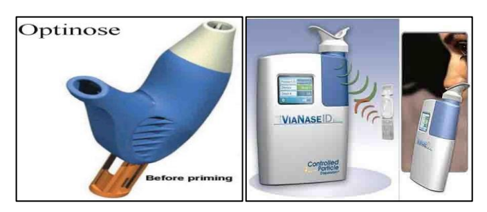
Fig 3: Devices used for Nasal delivery

formulation has poor spreading abilities. Without special application techniques it only occupies a narrow distribution area in the nasal cavity, where it is placed directly. Recently, the first nasal gel containing Vitamin B12 for systemic medication has entered the market.