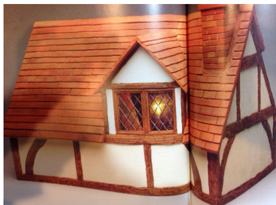
January Attic Room