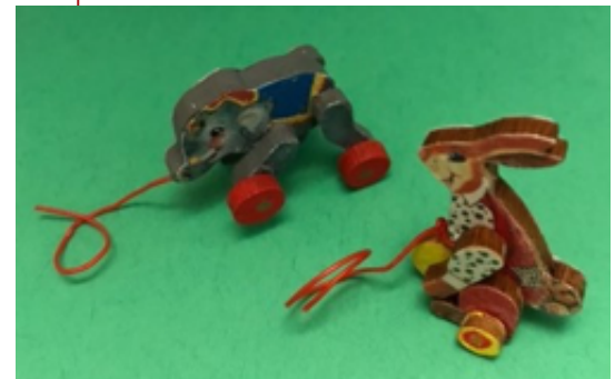
Projects the Itty Bitties members have made in the past few months