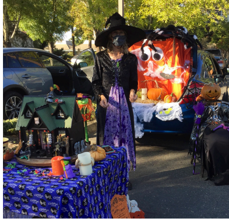
Billie's Halloween table