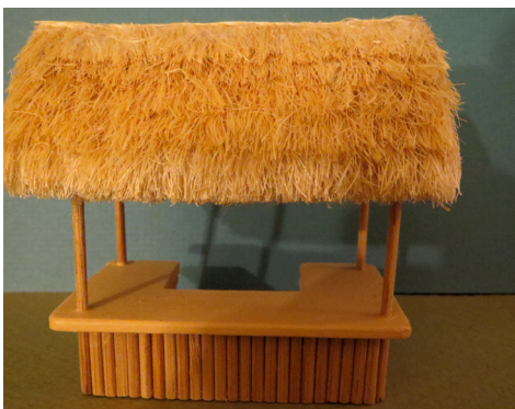
Lynn's Tiki hut