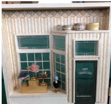
Laura's completed 1/4 scale Cynthia Howe hat shop kit