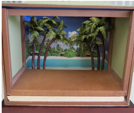
Box for Lynn's Tiki hut