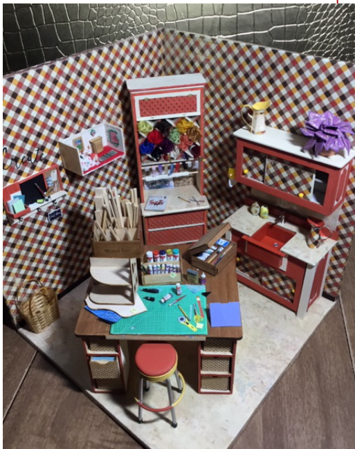
Margaret's completed NAME Day project