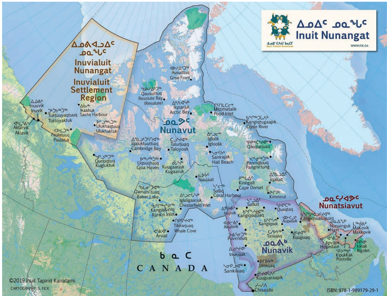
Figure 2: Inuit Nunangat is the Inuit homeland, encompassing 51 communities across the Inuvialuit Settlement Region, Nunavut, Nunavik, and Nunatsiavut