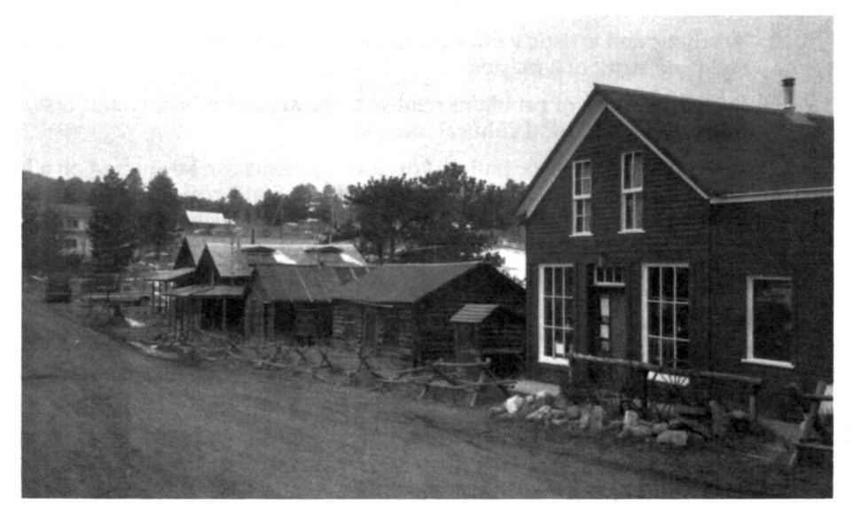
Main Street was included in the Gold Hill Historic District, a property nominated to the National Register of Historic Places as part of the Metal Mining and Tourist Era Resources of Boulder County, Colorado multiple property submission. Dating from the early 1870s, the Gold Hill Historic District is considered the most "intact representation of the early mountain communities that developed as a result of the precious metal mining in Boulder County."

Historic contexts may include those identified in the State historic preservation office comprehensive planning process. According to the Secretary of the Interior's Standards and Guidelines for Archeology and Historic Preservation, historic contexts provide information about the historical patterns and trends that produced individual properties. Historic contexts serve as the foundation for decisions about the identification, evaluation, registration, and treatment of historic properties. For further explanation of historic contexts, see discussion in section E.