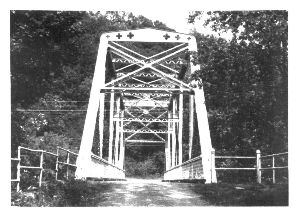
The 1898 Birmingham Bridge was nominated to the National Register of Historic Places as part of the Industrial Resources of Huntingdon County, Pennsylvania multiple property submission. Located in Birmingham, it is significant as "a fine example of one of the county's less than ten remaining pin-connected Pratt through truss bridges built in the late 1800s." (Nancy Shedd )

For properties significant under Criterion C, summarize the following: