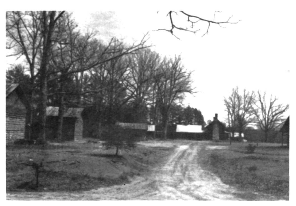
This cluster of agricultural buildings that make up the ca. 1899 Puckett Family Farm at Satterwhite, Historic and Architectural Resources of Granville County, North Carolina has been described as "one of the county's most significant bright leaf era rural properties, an intact symbol of the way most of the county's citizenry led its life from the Civil War into the 1950s." It was nominated to the National Register of Historic Places as part of the geographically-based Granville County, North Carolina multiple property submission. (Marvin A. Brown)