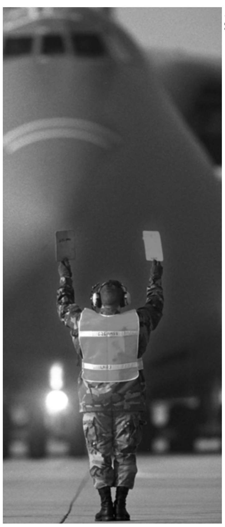
Big bird: NATO nations are dependent on the United States for long-range air transport

time. Made up entirely of professional troops, in accordance with the Commission's recommendations, this force of 50,000 is to be transformed into a 150,000-strong