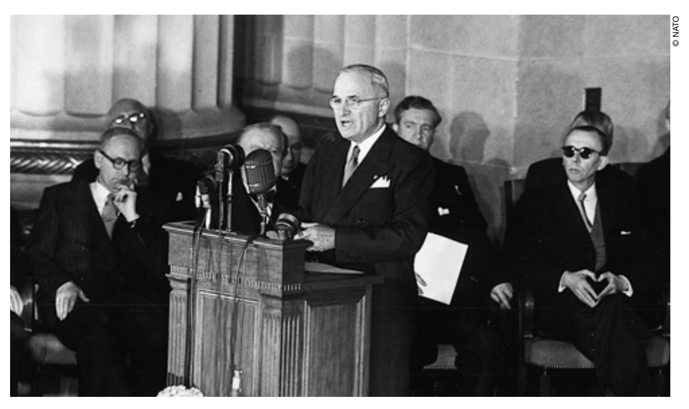
Visonary words: President Truman's ideas served as a beacon to light up post-war darkness and still illuminate the way forward