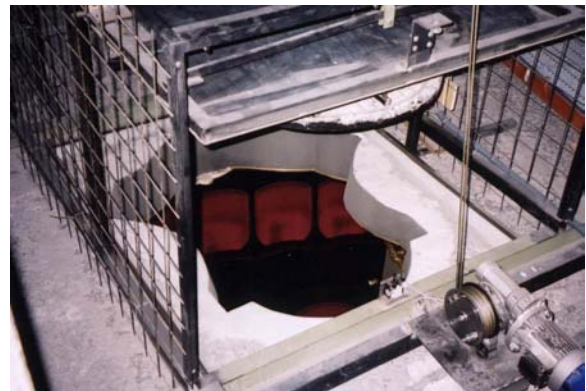
Figure 4: Openable ceiling vent, Zurich Opera House seen from within the roof void.

External vents are visible around the roof on all sides, and there is large central vent at the roof apex with slatted sides.