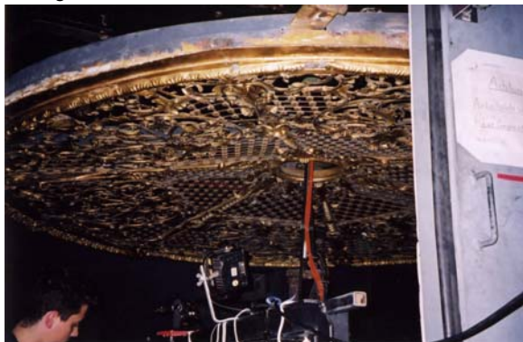
Figure 3: Mesh above central chandelier vents hot air into roof void, Zurich Opera House.

The Zurich Opera House opened in 1891, and then underwent refurbishment in 1984. The air-conditioning system in the building has been in place since the refurbishment, but remnants of the old natural ventilation system can still be seen in the ceiling and roof void.