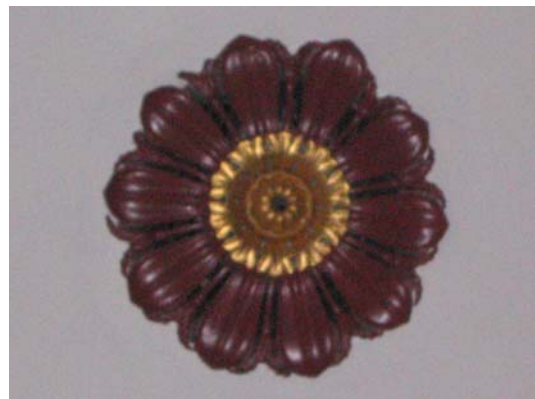
Figure 5: Ceiling rose vents hot air into roof void, St George's Bristol.

A series of 16 perforations in the auditorium ceiling for the venting of hot air into the roof void are articulated with ceiling roses. Four central roses are larger and more porous than those on the sides of the ceiling (Figure 5). The roof void is connected directly to the cupola through a large opening. The cupola itself has small louvred openings in all directions to the external air for ventilation.