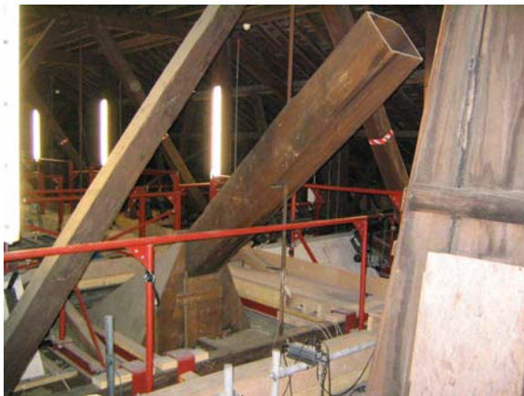
Figure 6: Truncated 19 th century timber ducts in roof void, St Georges Bristol. The existing ventilation system was replaced during the 1999 refurbishment.