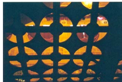
Figure 2: Latticed ceiling in the Royal Hall, Harrogate seen from below (top) and above (bottom).

At the uppermost level in the auditorium a separate ventilation circuit is created. There is an air intake shaft over the access point to the upper circles and extract through a sliding roof over the upper circle seating. This arrangement creates a direct exhaust air path to the external environment.