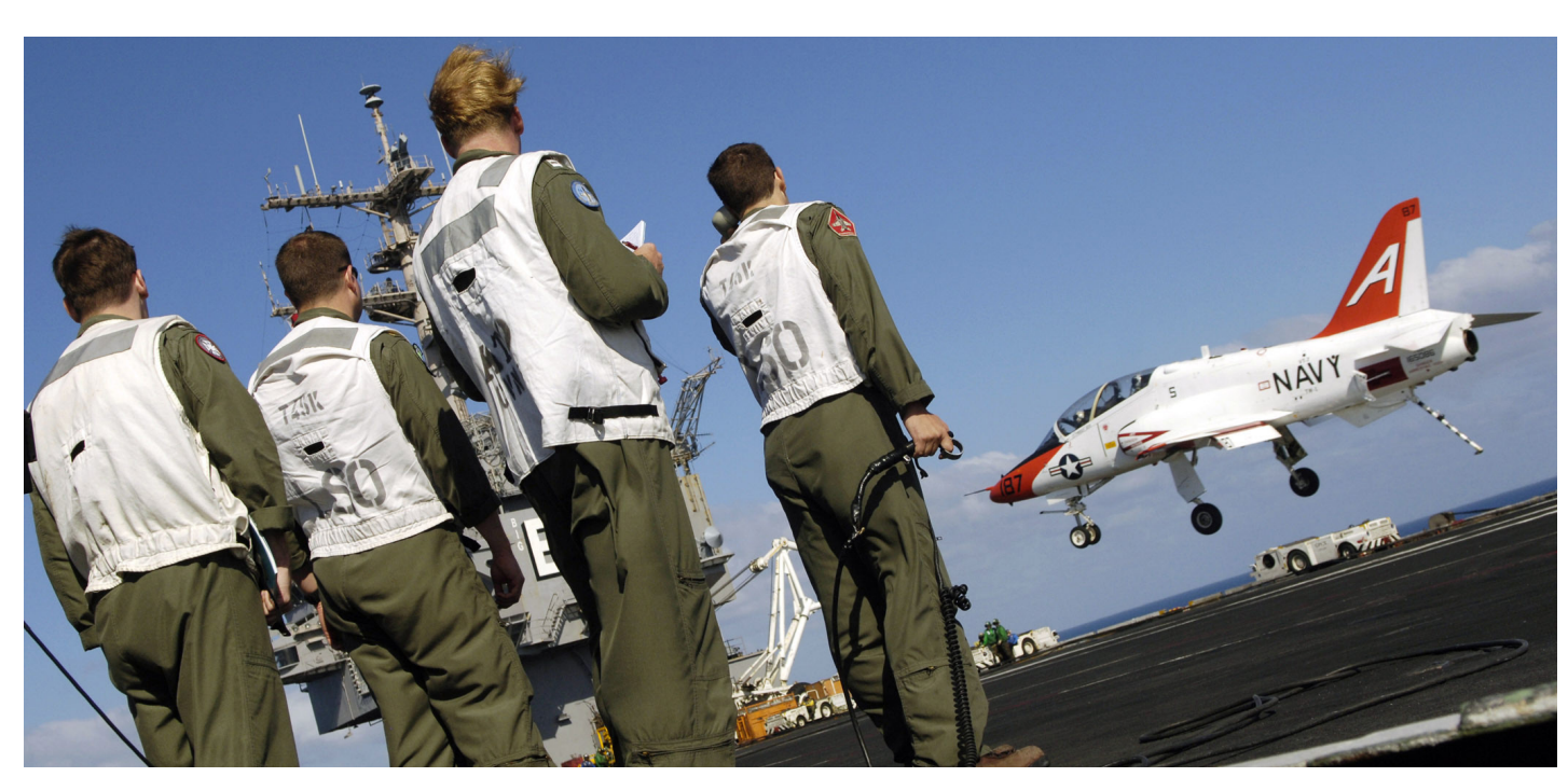
Landing signal officers direct the landing of a T-45 Goshawk, a two-seat, single-engine carrier training jet assigned to Training Air Wing (TW) 1, from the landing area of the nuclear-powered aircraft carrier USS Enterprise (CVN 65). Enterprise is underway conducting carrier qualifications.

For more information about Health Analysis at NMCPHC, visit <a href="http://www.med.navy.mil/sites/nmcphc/health-analysis/Pages/default.aspx">http://www.med.navy.mil/sites/nmcphc/health-analysis/Pages/default.aspx</a>