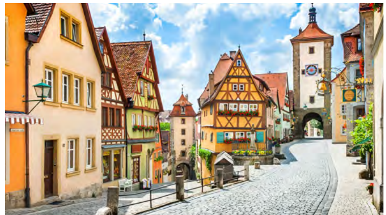
Rothenburg ob der Tauber