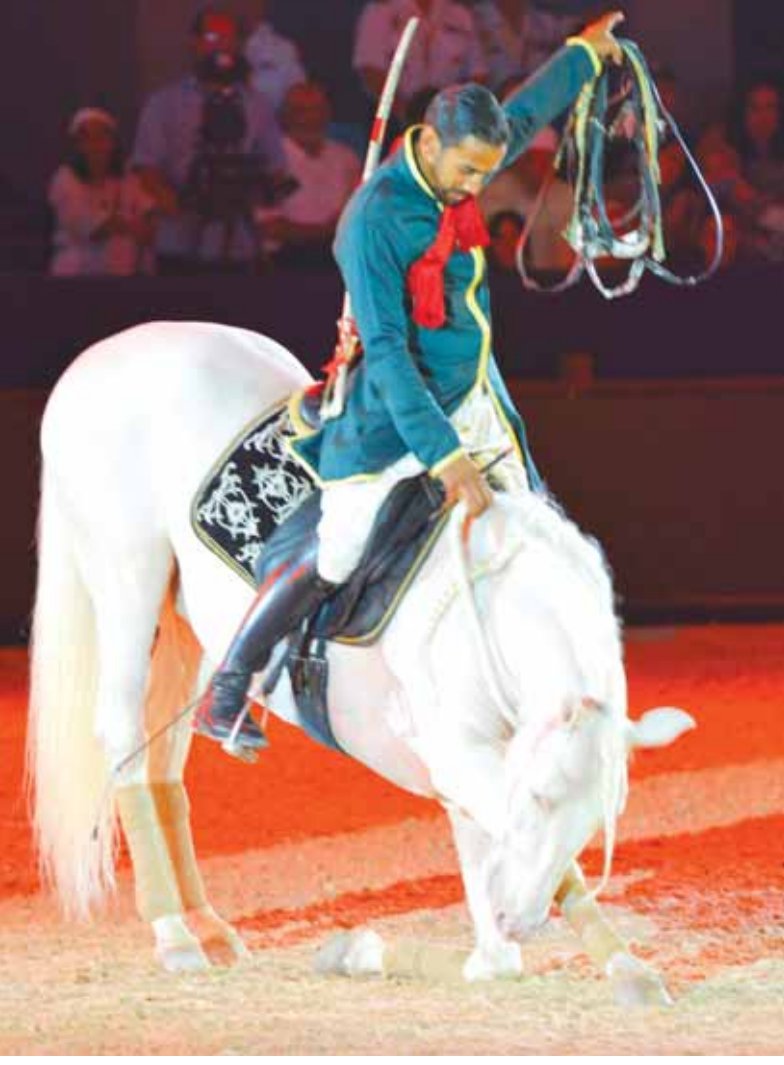
A performer at the Salon du Cheval d'El Jadida in Morocco. At bottom, the Qatari pavilion at the exhibition.

grammes aimed at the general public to the world stage. By focusing on equestrian and horse welfare to strengthening the status of the State of Qatar as a global centre for horse racing, QREC is working to establish Qatar as a leader