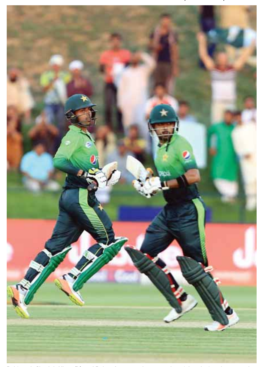
Pakistan's Shadab Khan (L) and Babar Azam run between the wicket during the second one day international (ODI) between against Sri Lanka in Abu Dhabi yesterday.

The remaining matches will be played in Abu Dhabi (October 18) and Sharjah (October 20 and 23). The two teams will also play three Twenty20 internationals, the first two in Abu Dhabi (October 26 and 27) and the last in Lahore (October