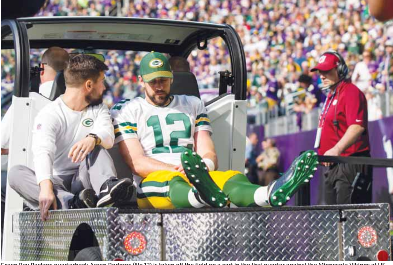
Green Bay Packers quarterback Aaron Rodgers (No 12) is taken off the field on a cart in the first quarter against the Minnesota Vikings at US Bank Stadium.

Rodgers was the Super Bowl 45 Most Valuable Player in 2011 as he led the Packers to a 31-25