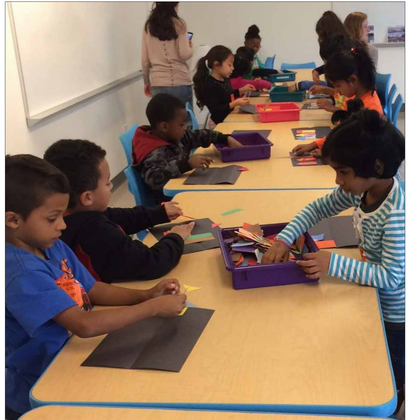
Manchester students begin an art project after a tour thanks to the SBM Charitable Foundation