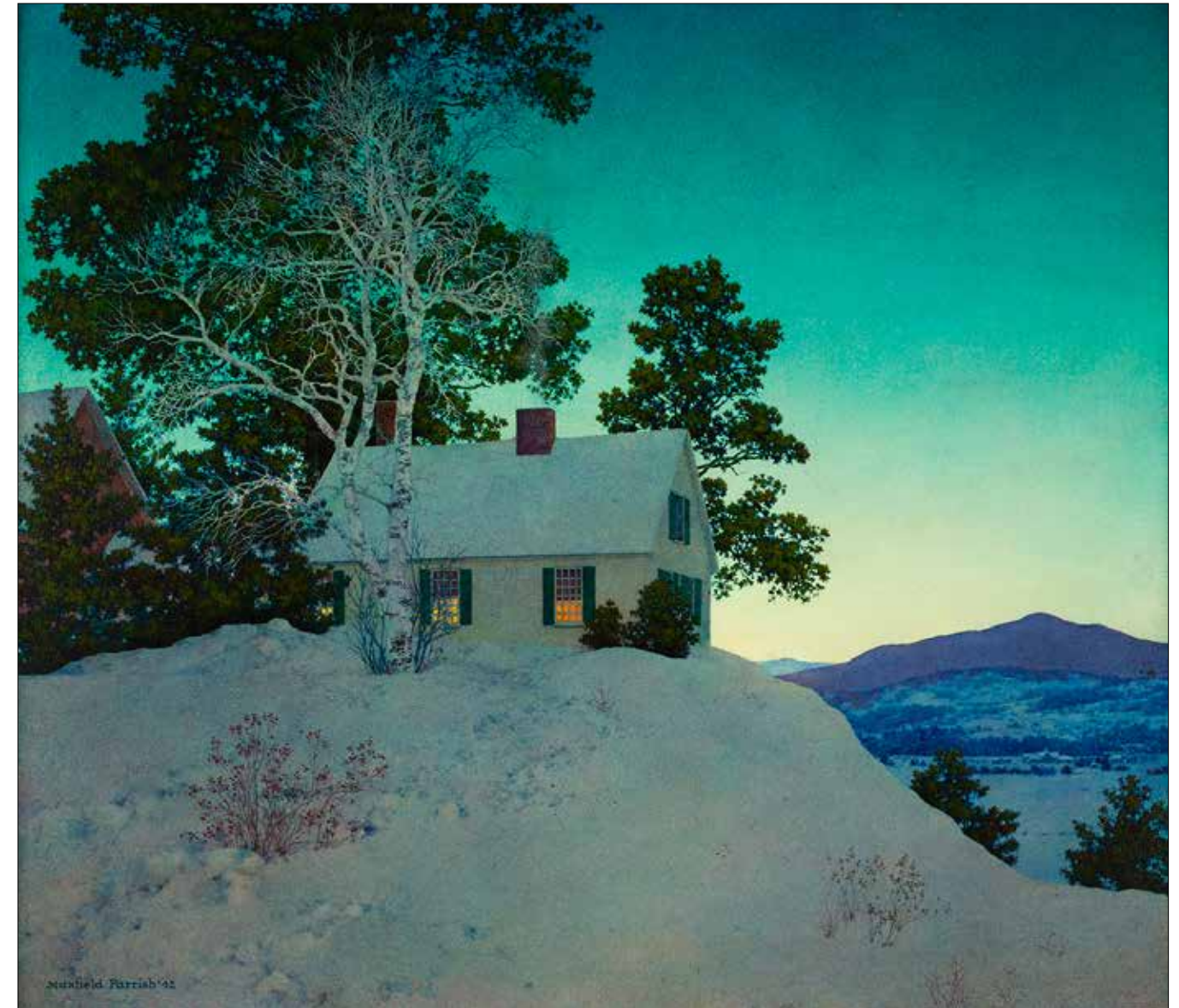
Maxfield Parrish, Dusk , 1942, 13 1/4 x 15 1/4 in., Oil on Masonite, Charles F. Smith Fund, 1966.52LIC