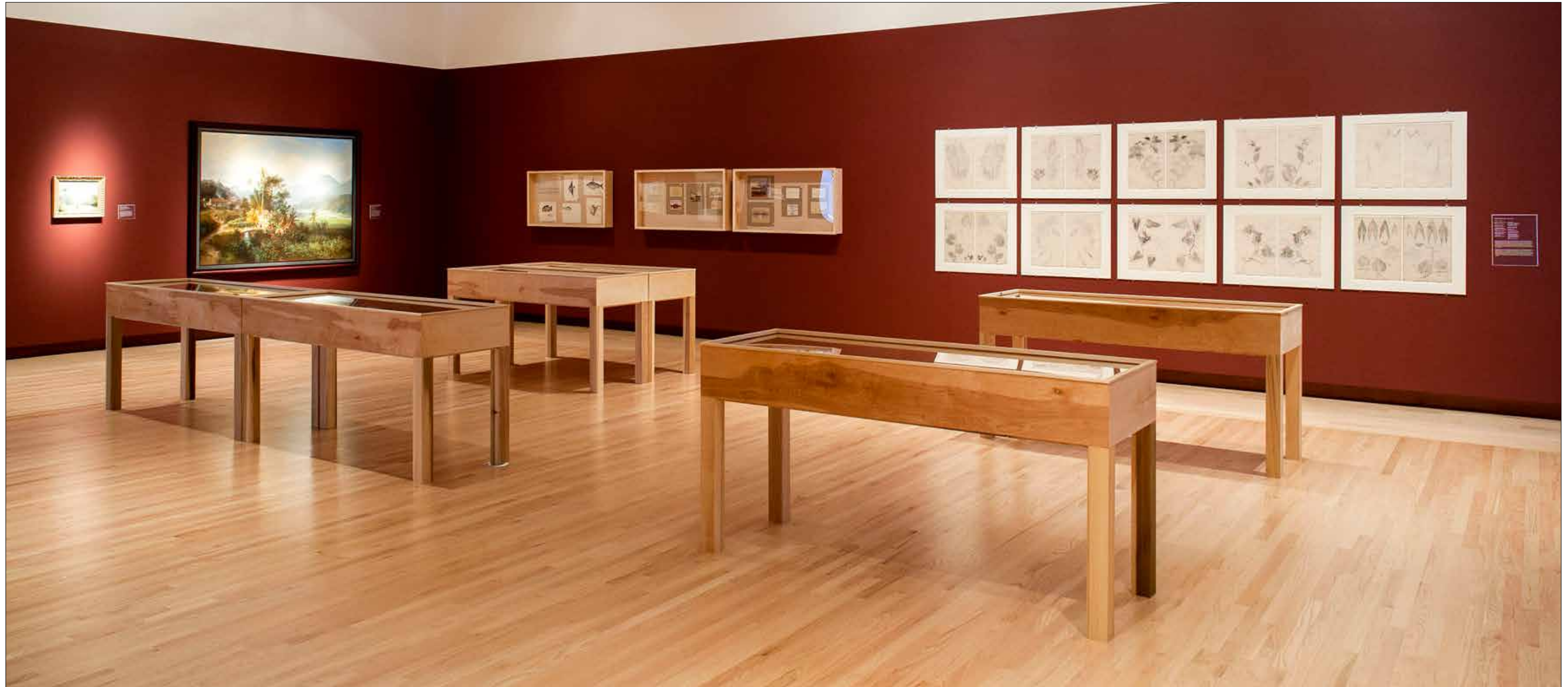
View of Vistas del Sur: Traveler Artists' Landscapes of Latin America from the Patricia Phelps de Cisneros Collection in the Stitzer Family Gallery