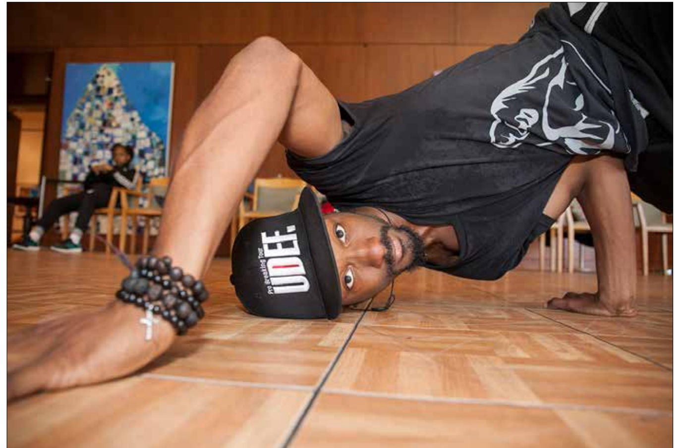
Local breakdancers, Problems Kru, showcase their moves at Family Day: Meditation & Movement on October 10, 2016