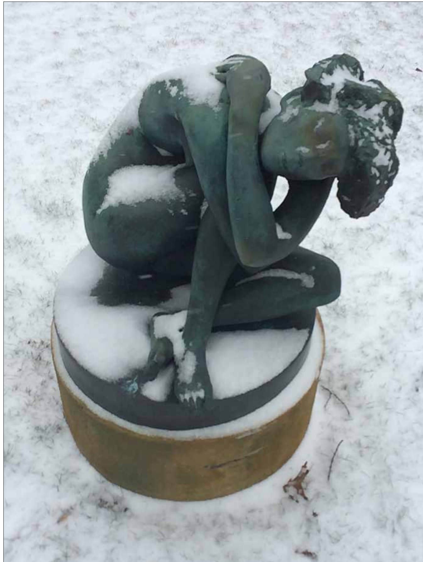
Elbert Weinberg, The Blind Sister of Narcissus , 1989, Bronze, 23 1/2 x 24 x 28 inches, Acquired from the Elbert Weinberg Trust