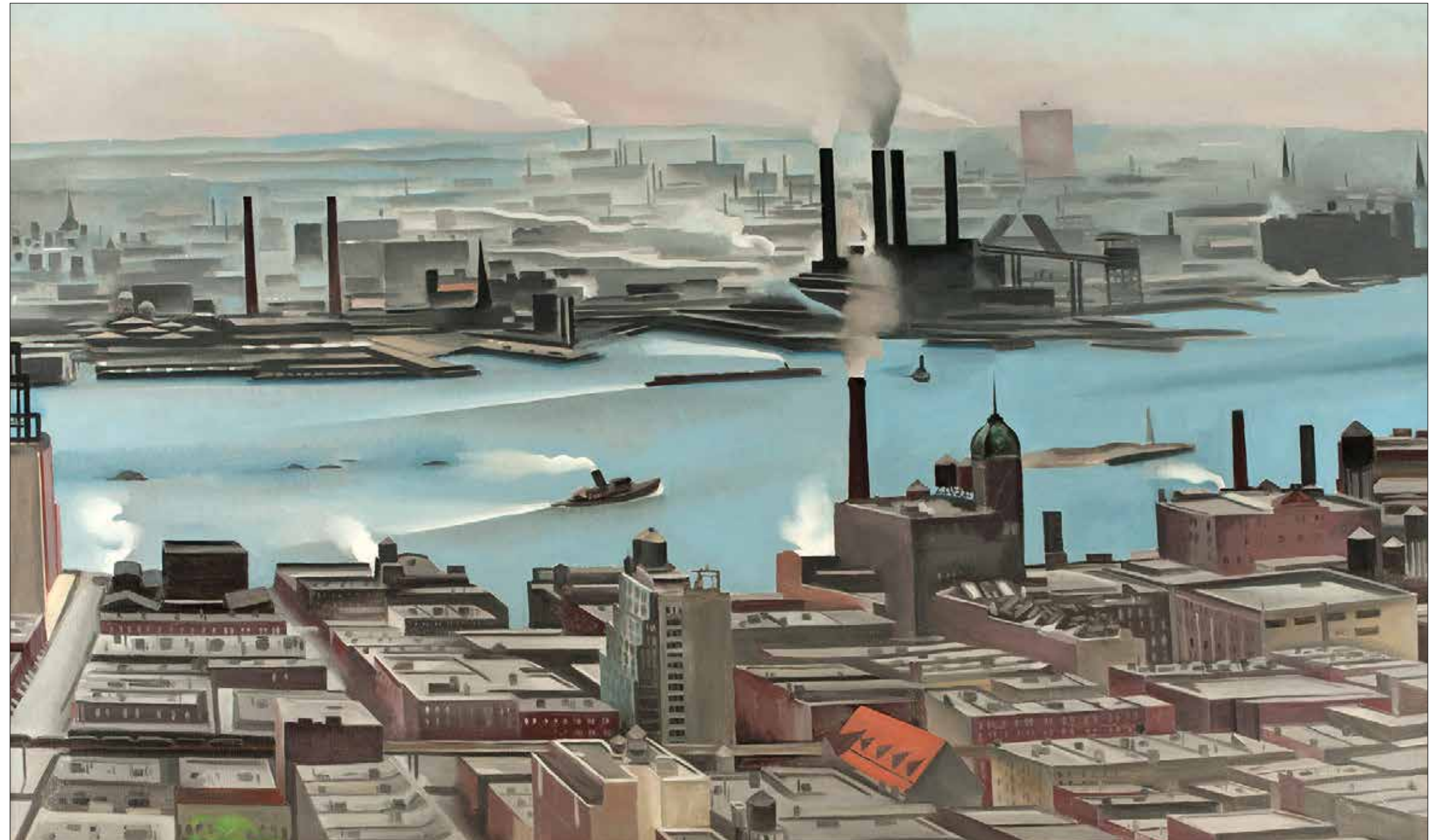
Georgia O'Keeffe, East River from the 30th Story of Shelton Hotel , 1928, Oil on canvas, 30 x 48 ⅞ in., Stephen B. Lawrence Fund, 1958.09

JOHN HENRY TWACHTMAN (1853-1902) Summer Trees , n.d. Oil on canvas 36 x 40 in. 2009.31LTL