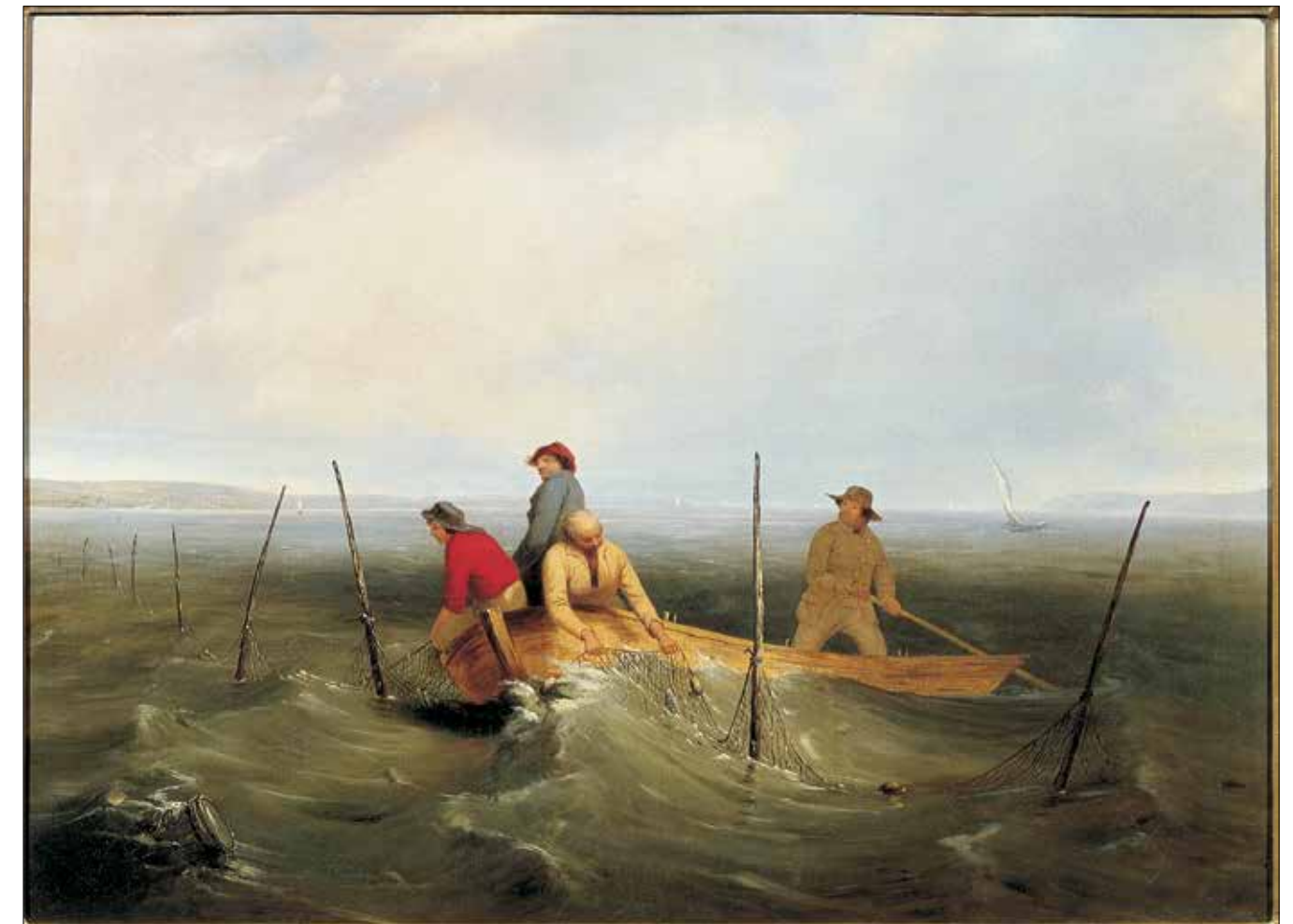
William Tylee Ranney, Shad Fishing on the Hudson , 1846, was on loan to the Connecticut River Museum from March 6–August 4, 2017