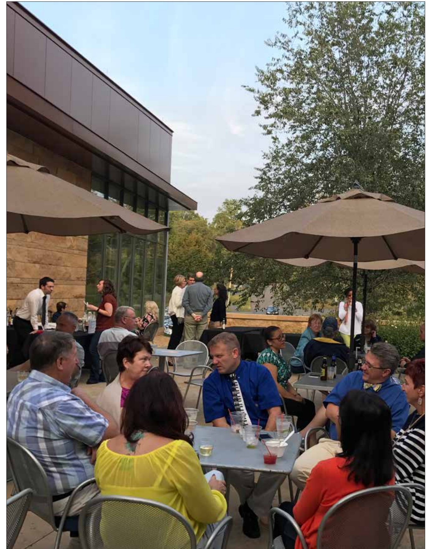
Patrons of the Museum's summer Pop-Up Bar on the Park enjoying a drink among friends on August 31, 2017