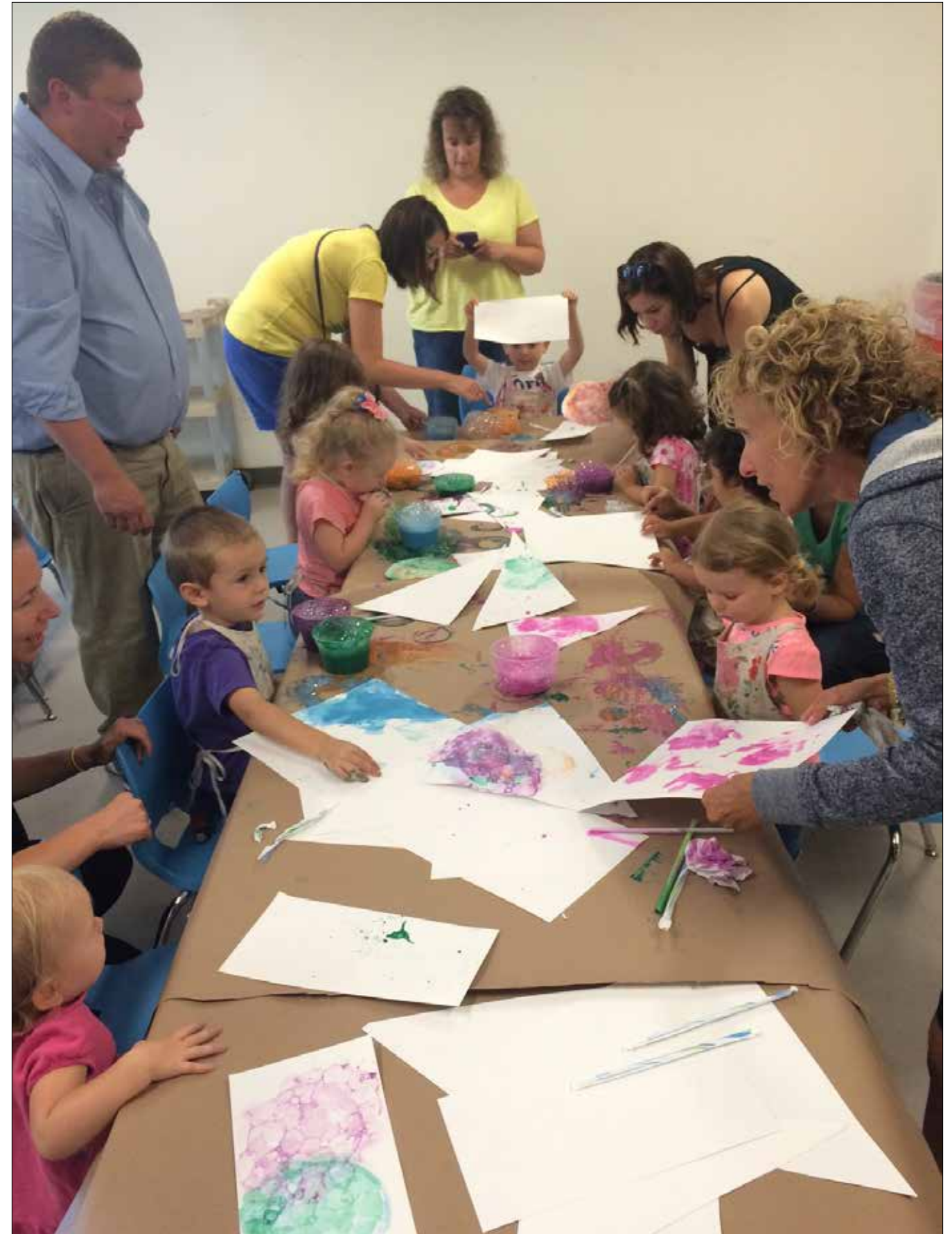
Art Start students play with color and texture during their hands-on art activity in the American Savings Foundation Art & Education Center.