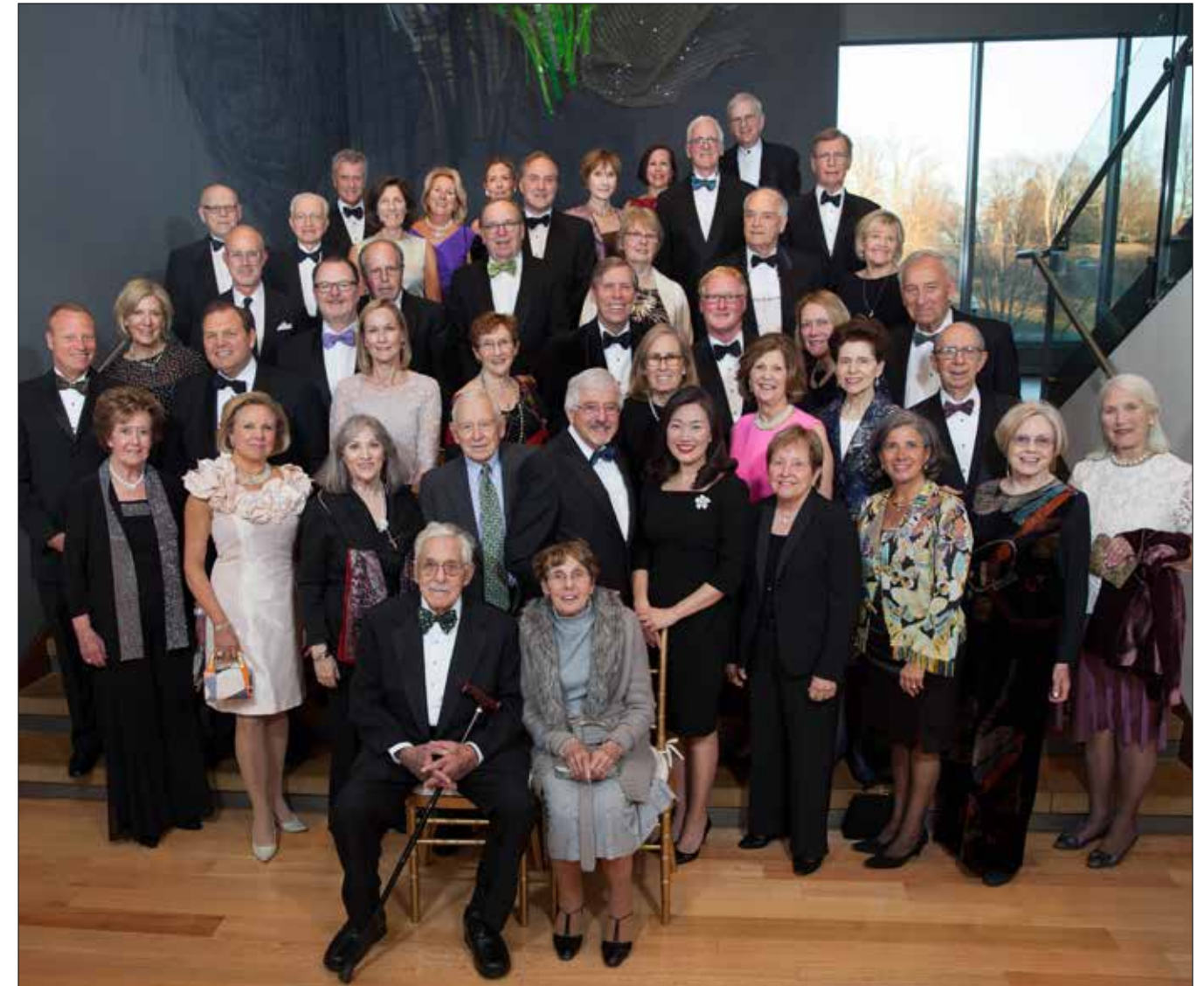
Many thanks to our John Butler Talcott Society and Grace Judd Landers Society Members who joined us for this year's Director's Dinner on April 8, 2017