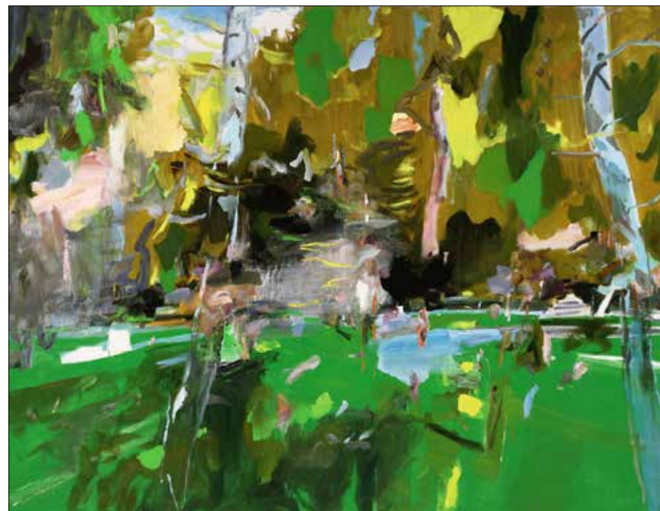
Eric Aho, Beekeeper , 2015, Oil on linen, 74 x 95 1/2 in., New Britain Museum of American Art

Extraordinary Visions , 1987 Blown glass 8 x 7 x 4 in. 2012.35.1LTL