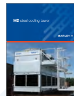
Marley MD Cooling Tower