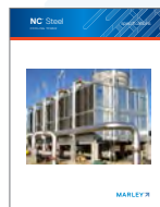
NC Steel Specifications