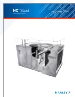
NC Steel Engineering Data