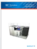
NC Fiberglass Engineering Data and Specifications

For further information about the NC Cooling Tower – including engineering schematics, data, layout requirements and more – download these NC publications and others at spxcooling.com .