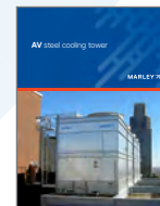
Marley AV Cooling Tower