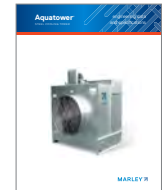
Marley Aquatower ® Cooling Tower