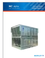
NC Alpha Splash-Fill Cooling Tower