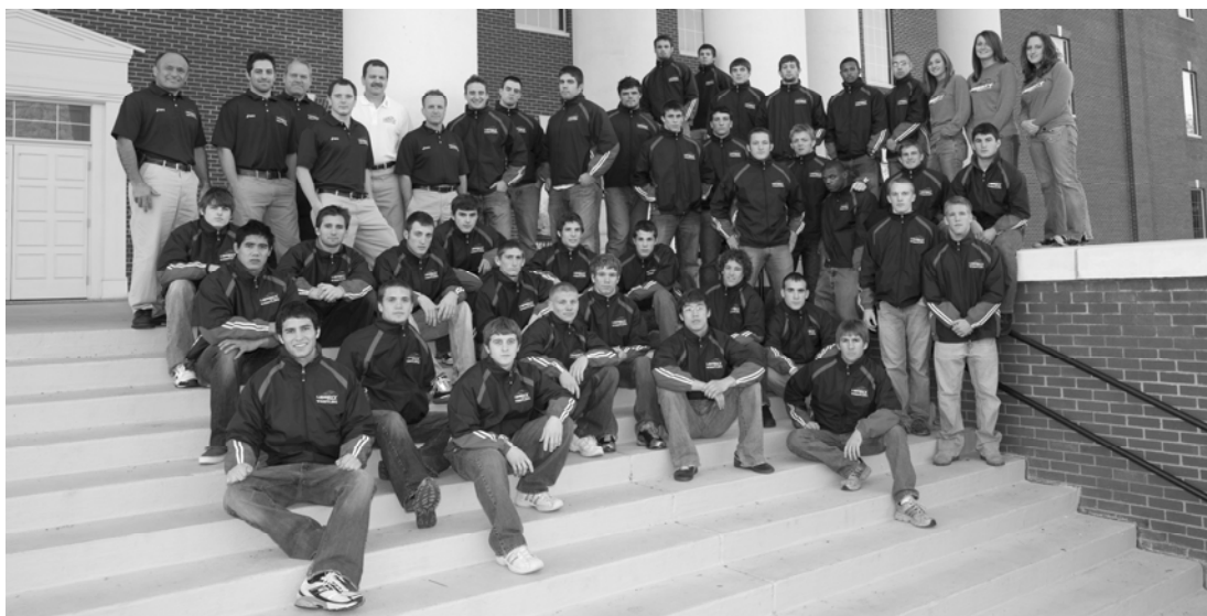
2007-08 Liberty University Wrestling Team Photo