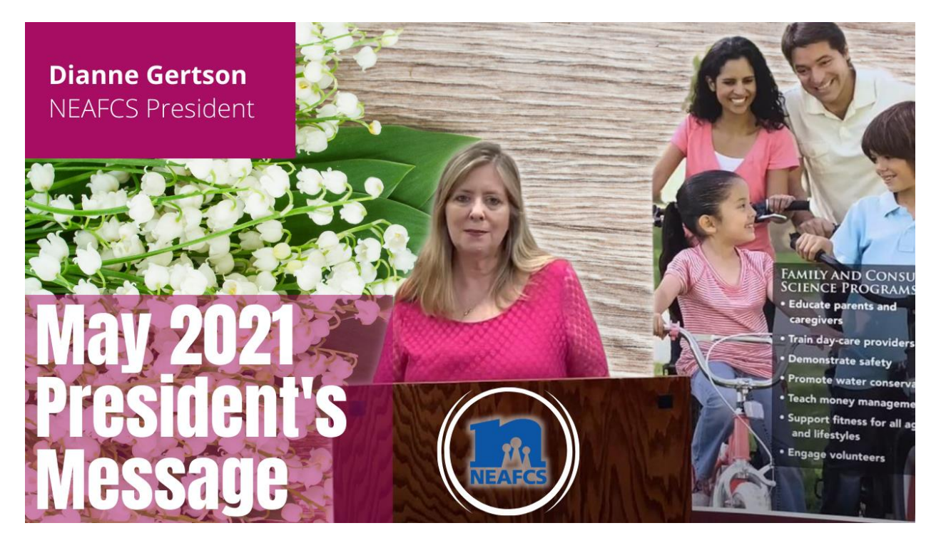
Please click the image above to view this month's President's Message

The first 5 people to <u>email me</u> with the location of the icon will be entered into a drawing for a free registration to the 2021 NEAFCS Annual Session.