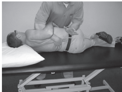
TABLE 2. Needle EMG readings pre-manipulation and post-manipulation.