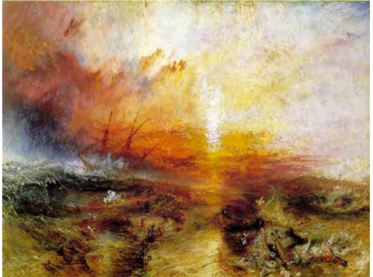
JMW Turner, The Slave Ship, 1840