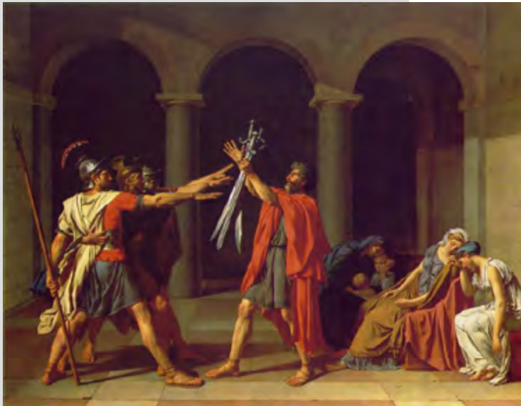
Jacques-Louis David, Oath of the Horatii 1784