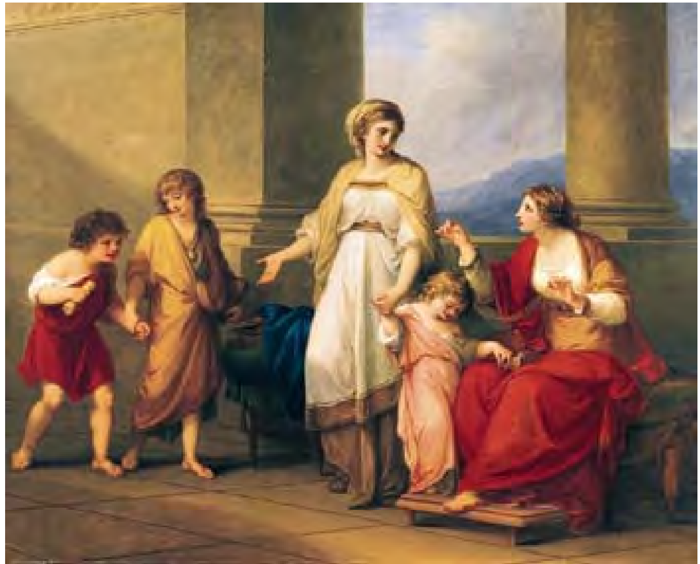
Cornelia, Mother of the Gracchi, Pointing to her Children as Her Treasures, Angelica Kauffman, circa 1785