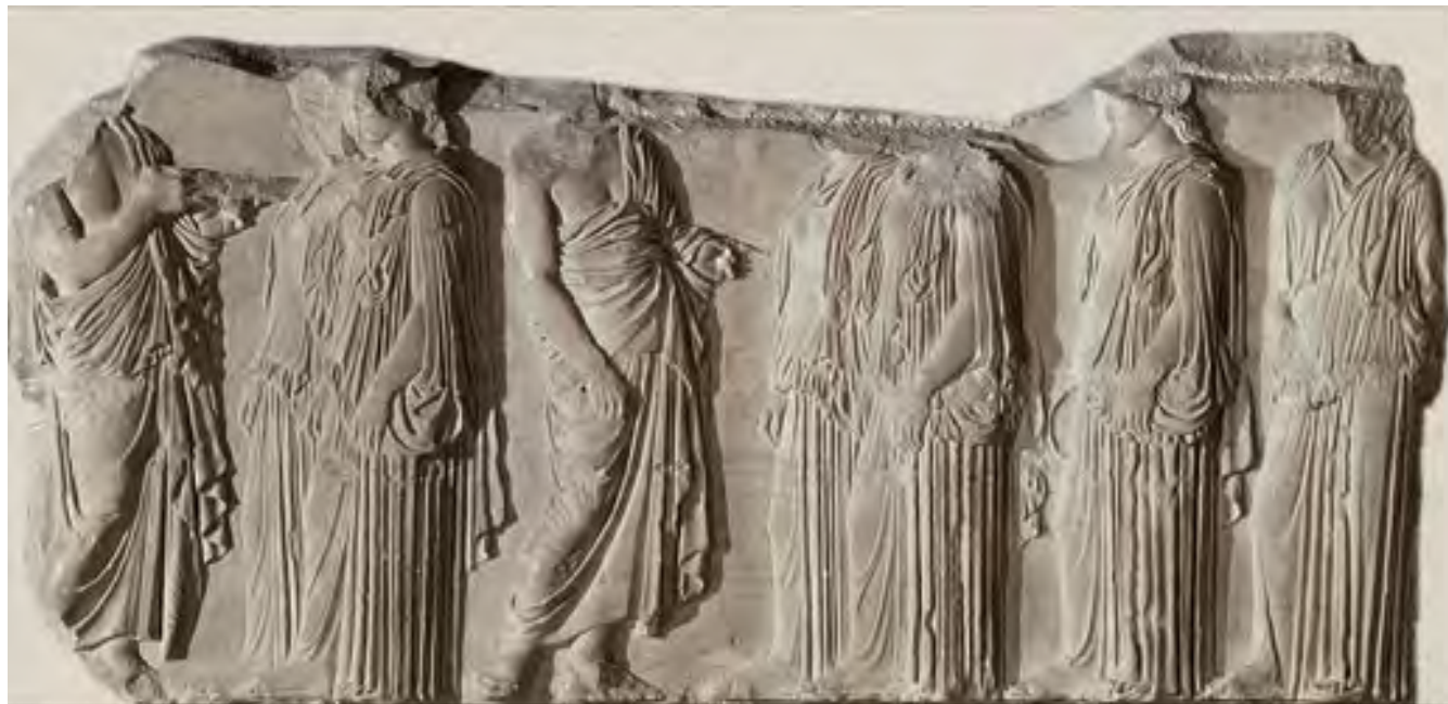
Parthenon, East frieze, sacrificial procession