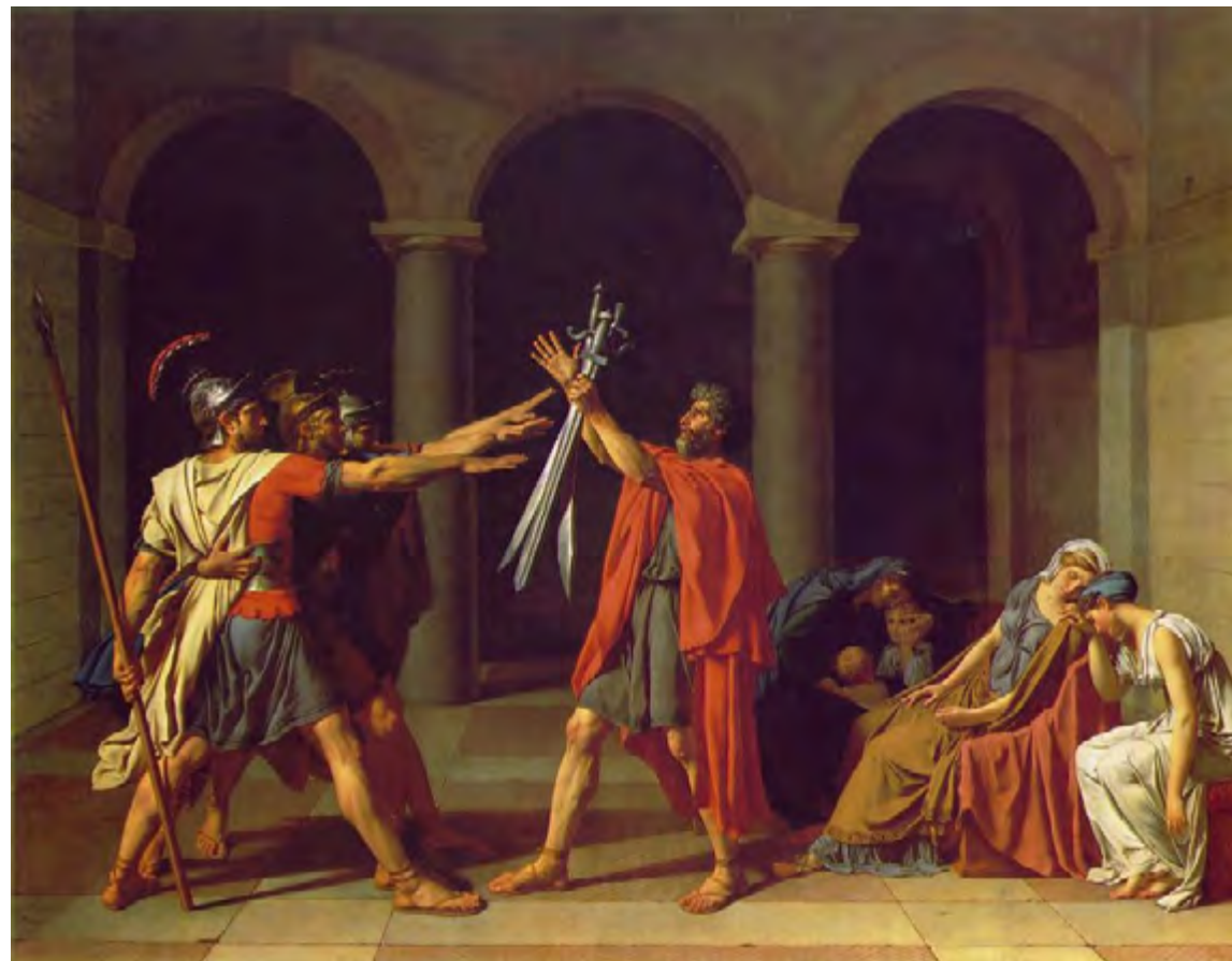
Jacques-Louis David, Oath of the Horatii 1784

*This painting created a sensation in 1785 when it was exhibited, arousing a patriotic zeal