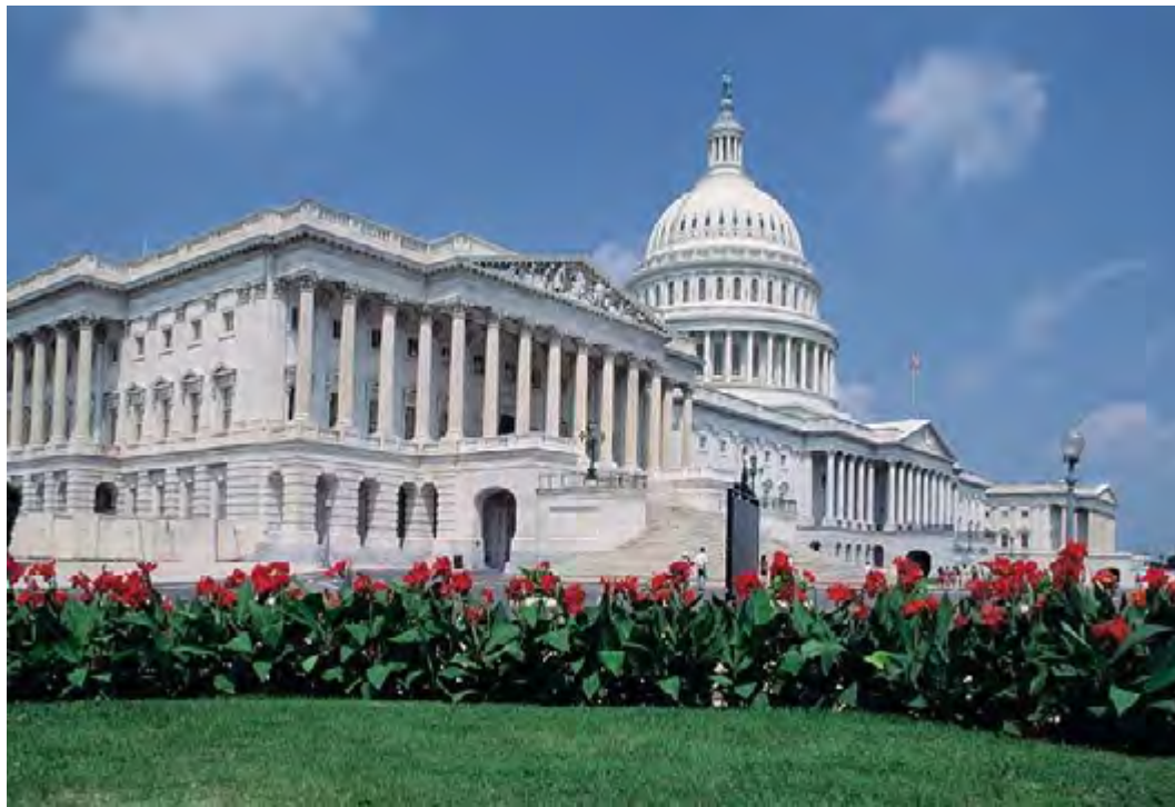
Capital, Washington, D.C., built 1793-1829 and 1851-1863