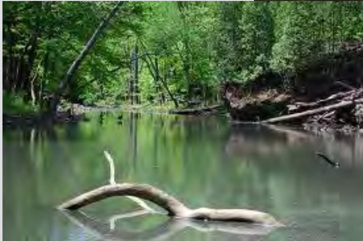
Robert S. Duncanson, Blue Hole - Little Miami River, 1851