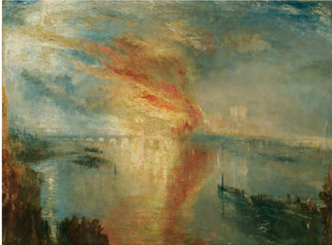
Joseph Mallord William Turner, The Burning of the Houses of Lords and Commons, October 16, 1834, 1835