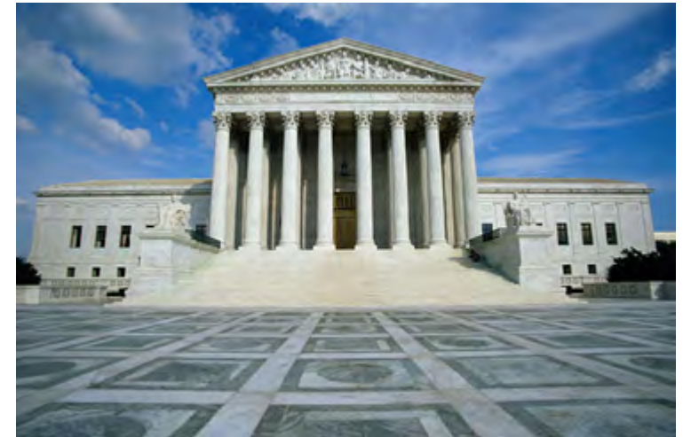
Supreme Court, American Neoclassical architecture