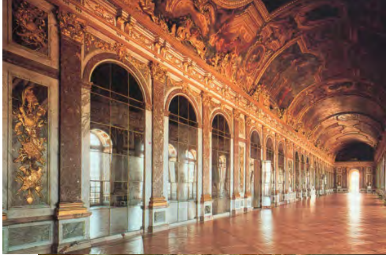
Hall of Mirrors, inside Palais de Versailles (1680) Jules Hardouin- Mansart

contrast the neoclassical austerity with the florid roccoco