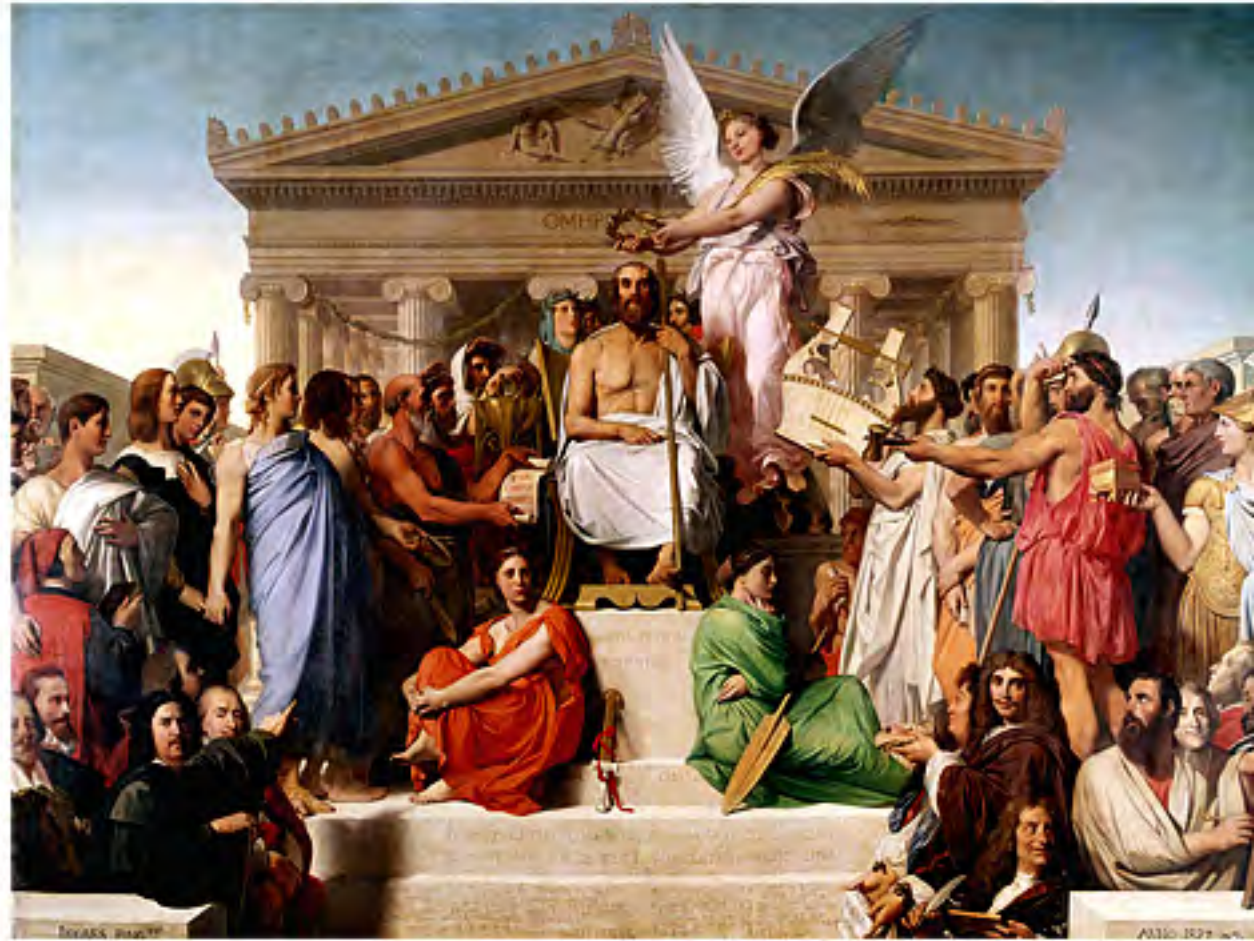
Apotheosis of Homer, Ingres, 1827

The Neoclassical style arose from first-hand observation and reproduction of antique works.