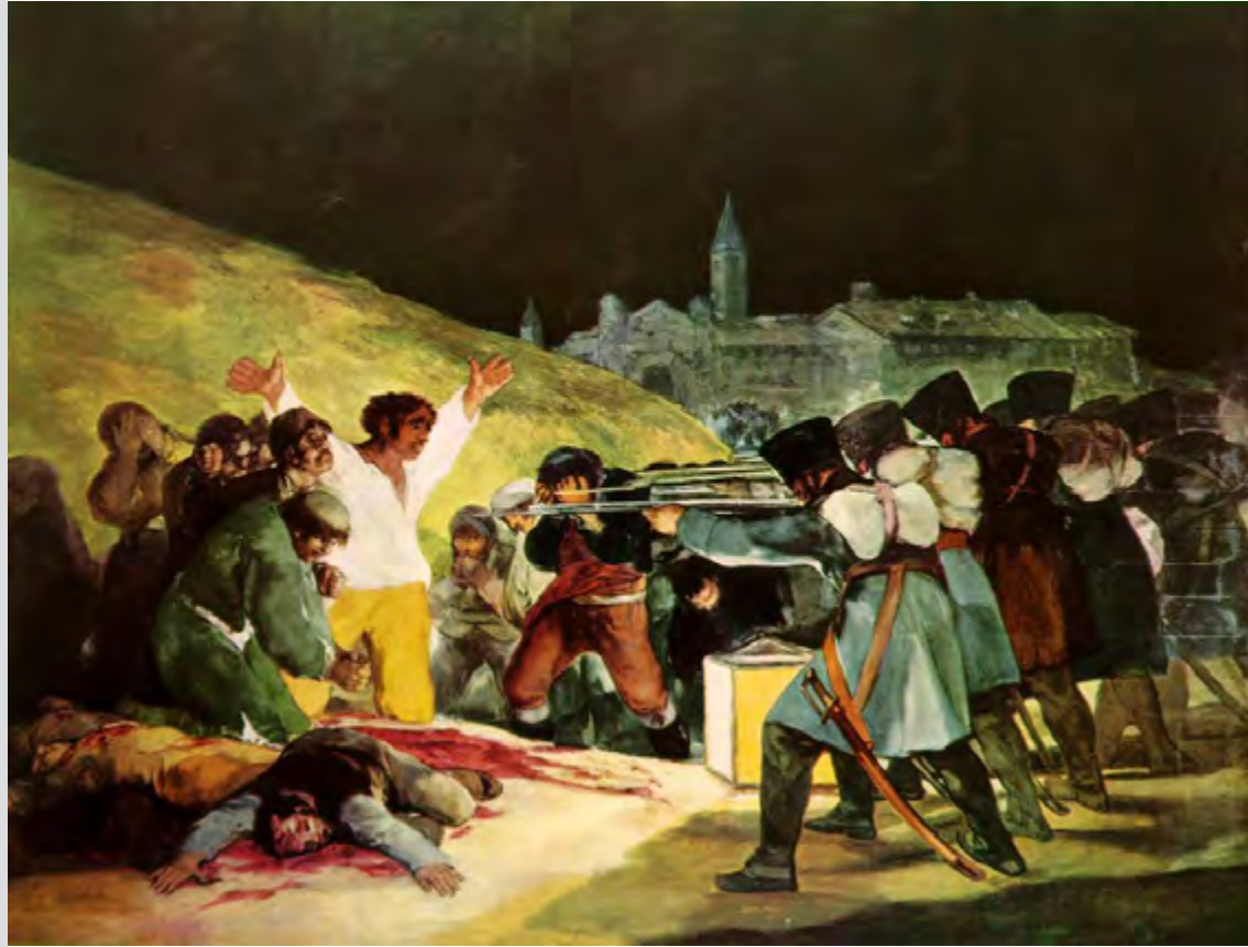
Francisco Goya, May the Third, 1808 -1814