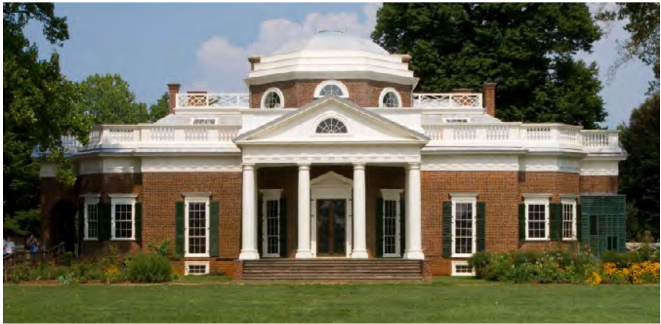
Monticello, Thomas Jefferson, 1772