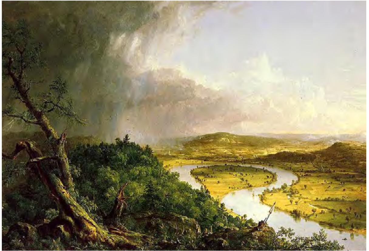
Thomas cole, The Oxbow, 1836