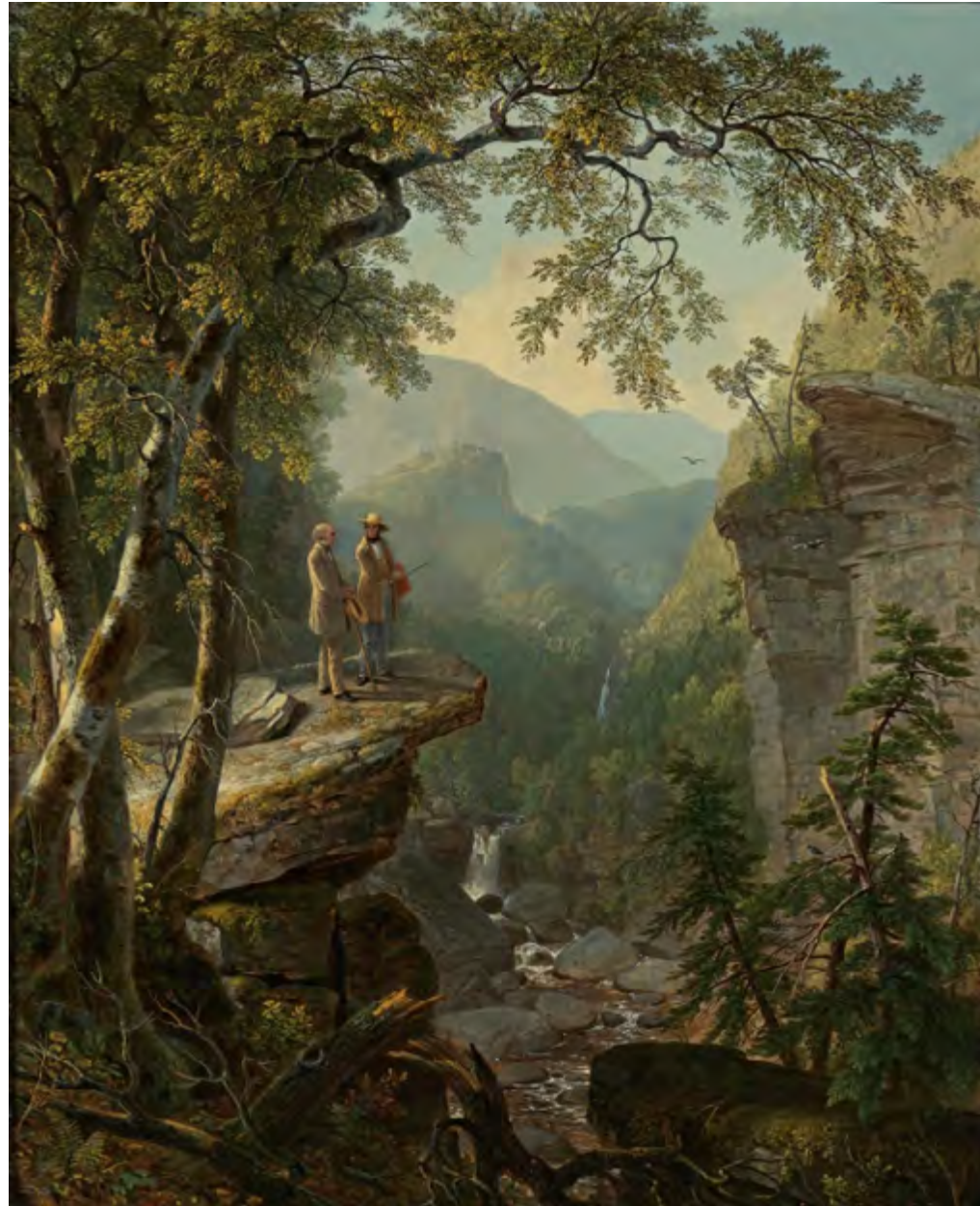
Asher Durand, Kindred spirits, 1849

Kindred Spirits is an homage to Thomas Cole, who had died suddenly in early 1848. Durand marshaled his skills as draftsman, genre painter, portraitist, and landscape painter to create a remarkable image. He memorialized Cole, who had been his own mentor, forever standing in a deep Catskill gorge, sketch portfolio in one hand and his recorder in the other, in company with their mutual friend Bryant. The botanical precision of the mountain forest and foreground trees marks the new direction toward realism in Durand's work. The gorge and the torrent embody geological process as well as sublime grandeur. The two figures might as easily be discussing their mutual fascination with the science of geology as meditating on the Romantic sonnet by John Keats for which the painting is named.