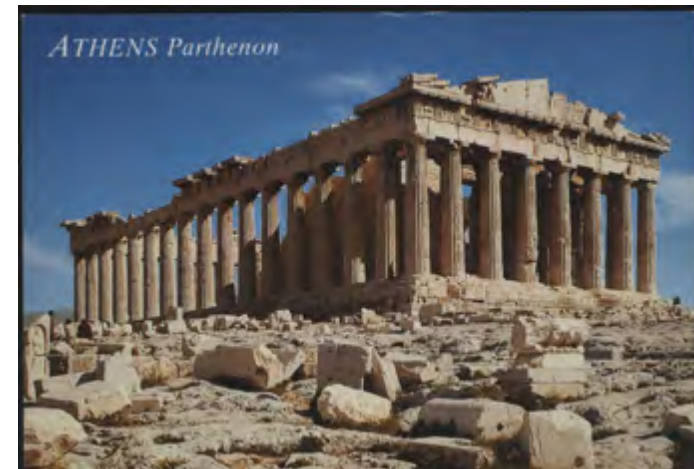
Parthenon, Athens, 5th c. b.c