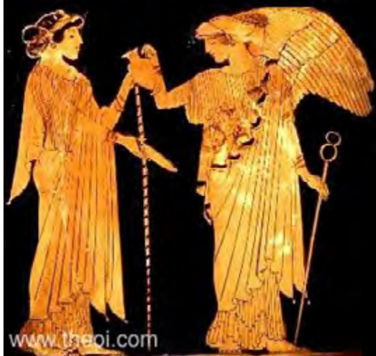
Attic vase painting