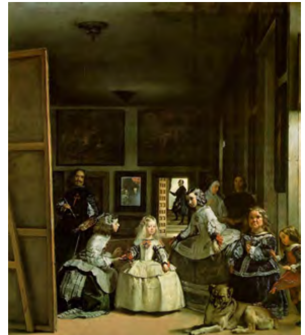
Diego Velazquez, Las Meninas, 1656