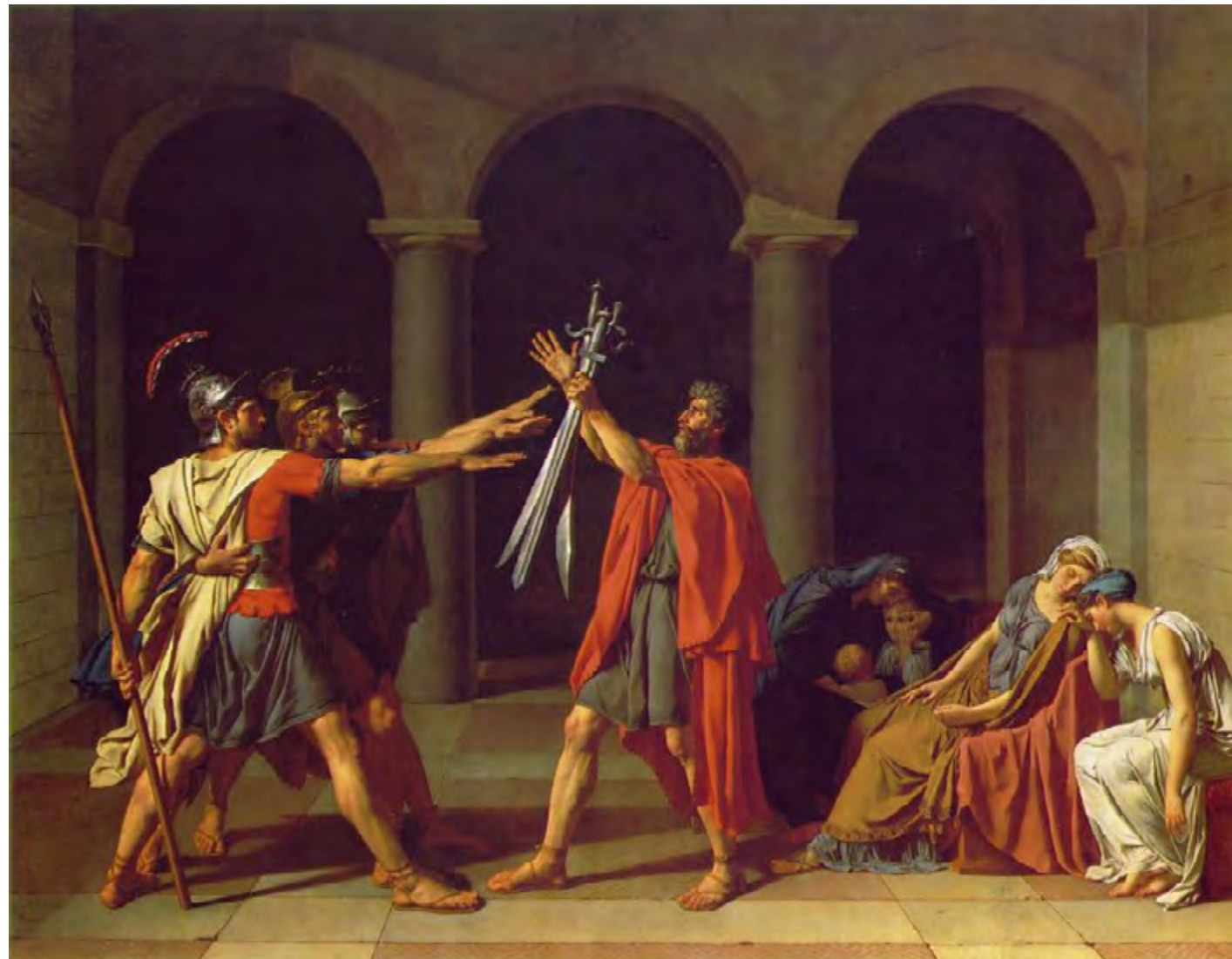
Jacques-Louis David, Oath of the Horatii 1784

-Oath of the Horatii was meant to evoke feelings of heroism and civic virtue, to inspire the people to devotion to the fatherland