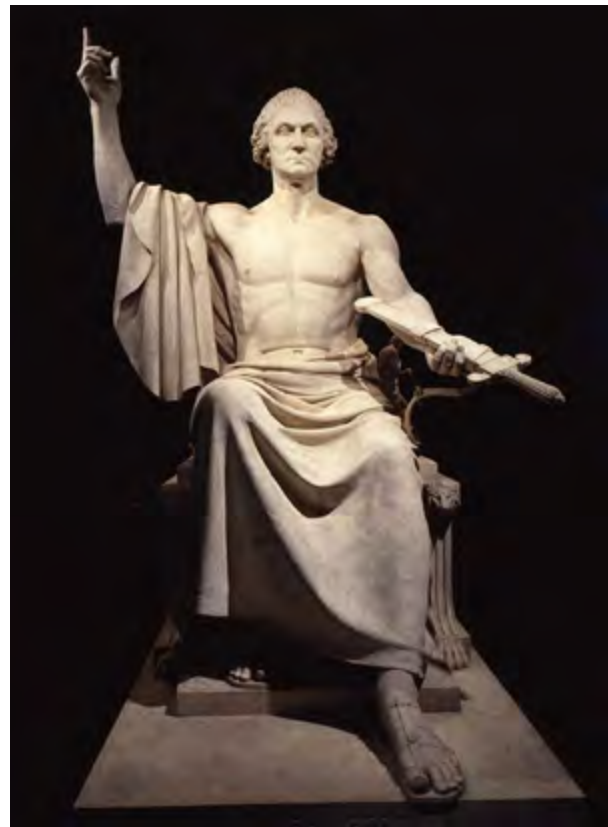
Horatio Greenough, George Washington, 1832-1841, marble, 11'4" high

Washington, half naked, was seen an undignified and the sculpture was deemed a failure. It was never placed in the capital, and one congressman suggested it be thrown into the Potomac.