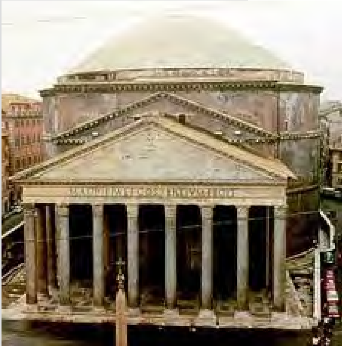
Pantheon, Hadrian, 125 c.e.

Compare the Greek portico extending from a drum and dome at the Pantheon with the domed portico style at Monticello.