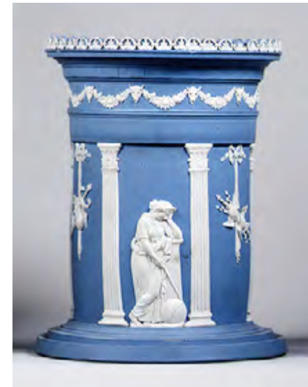
John Flaxman, Wedgwood Vase, late 18th century, made by Josiah Wedgwood and Sons, Etruria/Staffordshire, England Jasperware.

The sides are divided by pilasters into six panels containing figures of the Muses Thalia, Urania, and Erato, alternating with pendant trophies with attributes of Jupiter, Mars, and Mercury (thunderbolt, spear and helmet, caduceus)