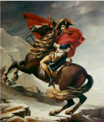
Jacques Louis David, Napoleon Crossing the Alps, 1800

Late style David returns to somewhat Baroque sensibility, coinciding with a shift in political loyalties