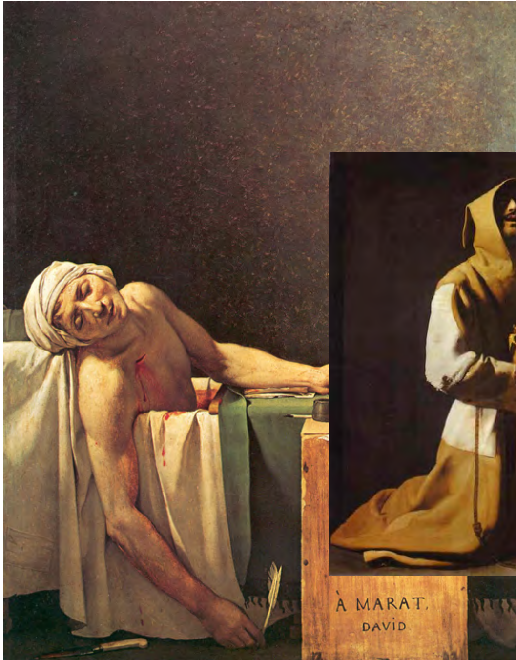
Jacques Louis David's "The Death of Marat" (1793)