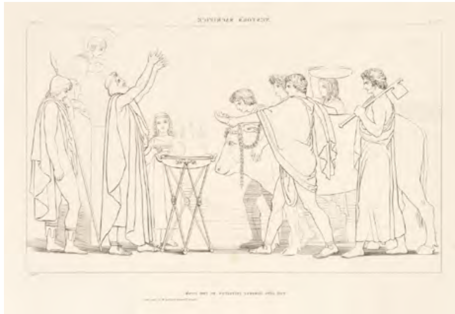
Nestor's Sacrifice (from the Odyssey of Homer), John Flaxman, etching and engraving on paper, 1805

Flaxman's engravings inspired Wedgwood China which was considered the perfection of the neoclassical ideal.