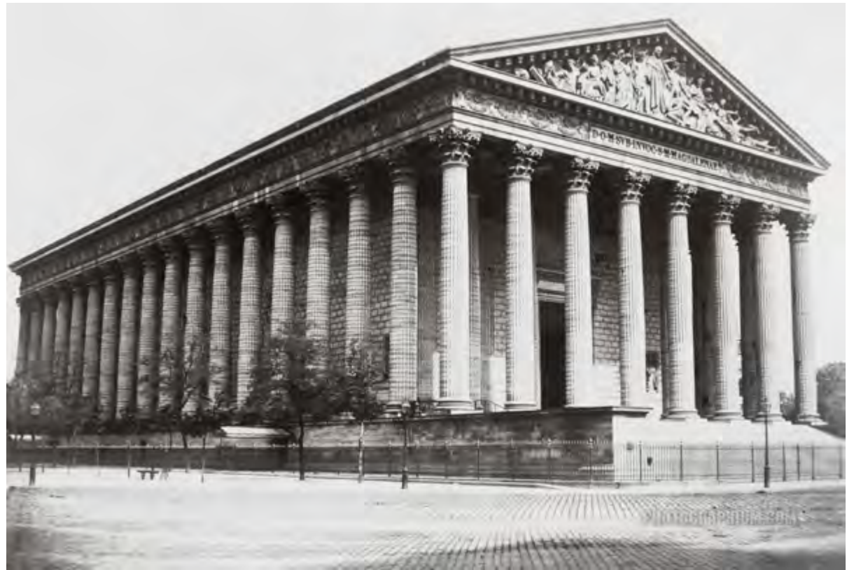
Church of the Madeleine, Pierre Vignon, Paris, 1851-1870

Late style David returns to somewhat Baroque sensibility, coinciding with a shift in political loyalties