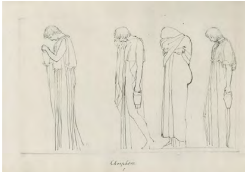
Electra Leading a Procession to Agamemnon's Tomb, John Flaxman, etching and engraving on paper illustrations to The Tragedies of Aeschylus, 1795