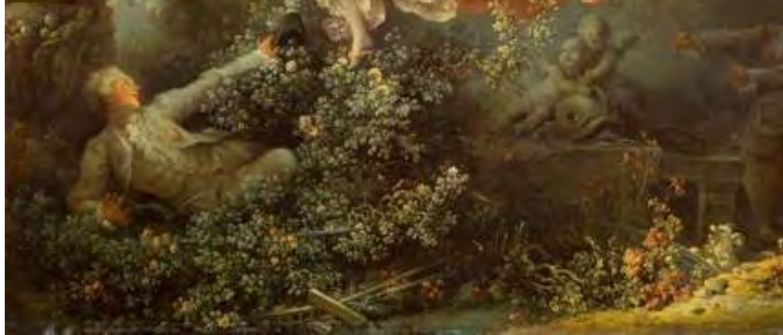
Cupid a Captive (1754) Francois Boucher