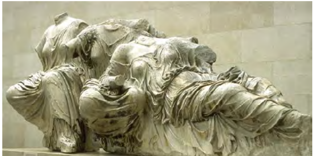
Three Goddesses. East pediment of the Parthenon. c. 438-432 B.C.