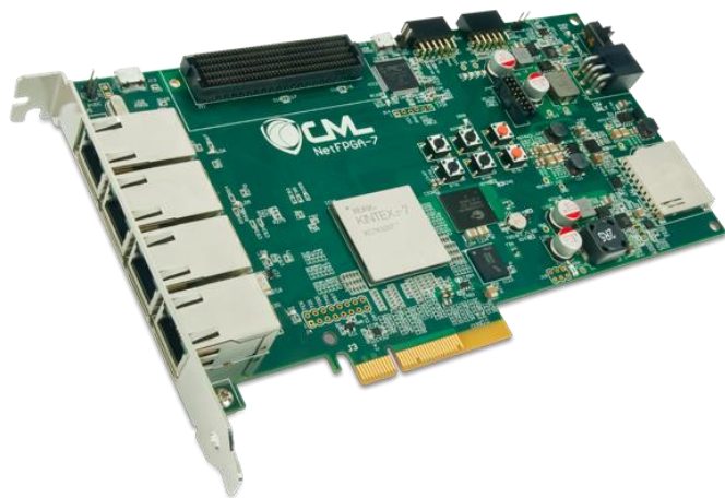
The NetFPGA-1G-CML board.

The NetFPGA-1G-CML is a versatile, low-cost network hardware development platform featuring a Xilinx® Kintex®-7 XC7K325T FPGA and includes four Ethernet interfaces capable of negotiating up to 1 GB/s connections. 512 MB of 800 MHz DDR3 can support high-throughput packet buffering while 4.5 MB of QDRII+ can maintain low-latency access to high demand data, like routing tables. Rapid boot configuration is supported by a 128 MB BPI Flash, which is also available for non-volatile storage applications. The standard PCIe form factor supports high speed x4 Gen 2 interfacing. The FMC carrier connector provides a convenient expansion interface for extending card functionality via Select I/O and GTX serial interfaces. The FMC connector can support SATA-II data rates for network storage applications. The FMC connector can also be used to extend functionality via a wide variety of other cards designed for communication, measurement, and control.