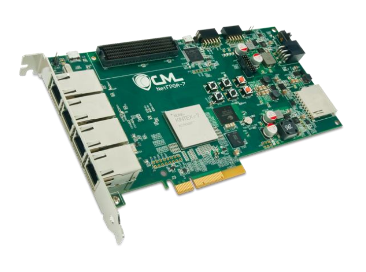
Low-jitter 200 MHz oscillator

The NetFPGA-1G-CML is a versatile, low-cost network hardware development platform featuring a Xilinx® Kintex®-7 XC7K325T FPGA and includes four Ethernet interfaces capable of negotiating up to 1 GB/s connections. 512 MB of 800 MHz DDR3 can support high-throughput packet buffering while 4.5 MB of QDRII+ can maintain low-latency access to high demand data, like routing tables. Rapid boot configuration is supported by a 128 MB BPI Flash, which is also available for non-volatile storage applications. The standard PCIe form factor supports high speed x4 Gen 2 interfacing. The FMC carrier connector provides a convenient expansion interface for extending card functionality via Select I/O and GTX serial interfaces. The FMC connector can support SATA-II data rates for network storage applications. The FMC connector can also be used to extend functionality via a wide variety of other cards designed for communication, measurement, and control.