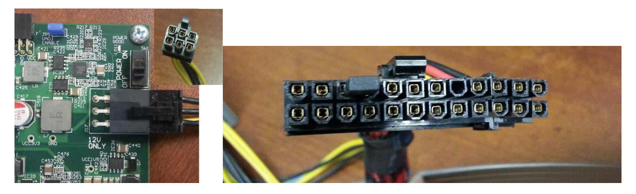
Figure 1. Left: NetFPGA-1G can be powered by plugging the 6-pin PCIe power connector in J17; Right: Pin 16 and 17 are shorted using a jumper to power on a standard ATX power supply when used standalone.

The NetFPGA-1G can be powered using the 6-pin PCIe power supply connector (Fig. 1) of any standard ATX power supply. When installed on a PC motherboard, you can directly plug the 6-pin PCIe power supply connector of your PC power supply into J17. When used standalone (without a motherboard), you need to short pins 15 and 16 (pulling down PS_ON signal) of the main 20-pin connector of the standard ATX power supply to power-on the ATX unit (Fig.1).