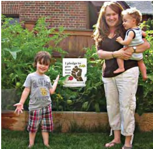
This youngster is proud, and rightly so, of their garden's sign: I pledge to grow more food