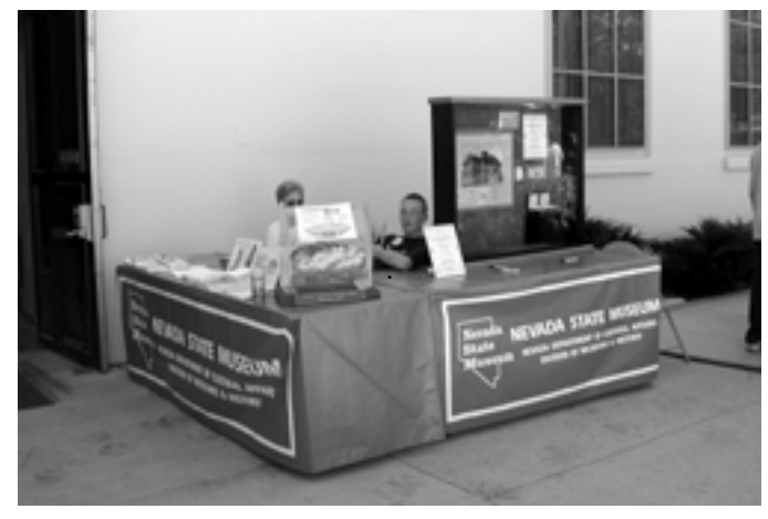
Other aspects of the Coin Show included the drawing for prizes at the conclusion of the show. Here's the manned booth for tickets.