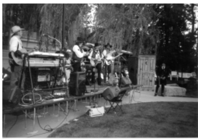
The band entertained everyone all evening with suitable music.