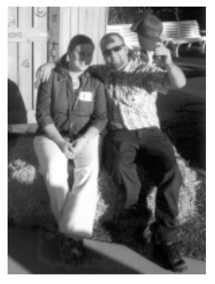
Attending the event from Southern California, the couple found the ideal backdrop for a photo. It has been used for many photos by visiting Tin Cuppers before.