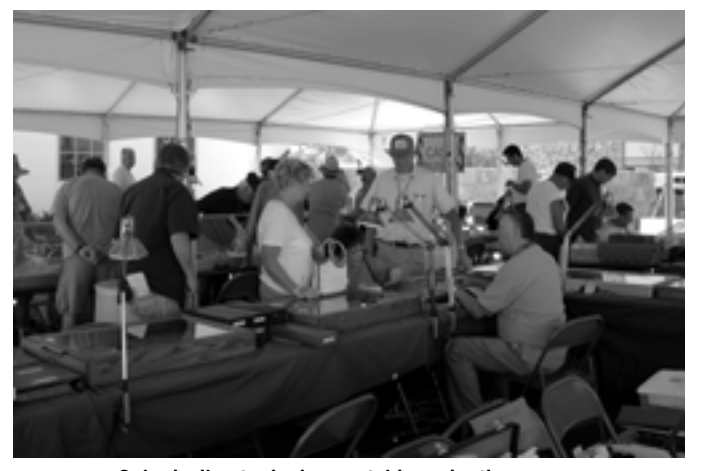
Coin dealing took place outside under the canvas as well as in the original Mint Building and its additions.