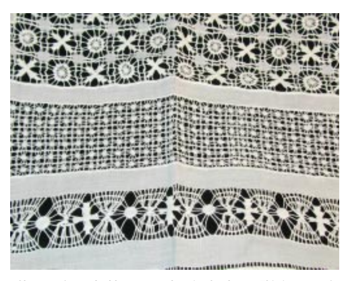
Closeup of a card table cover made using hardanger. This is a type of openwork embroidery where threads are counted and rolled into "kloster blocks" which then enclose the cut areas. The The remaining areas are then needlewoven together using a variety of embroidery stitches. Ca. 1940-50s.

But in addition to our work, we do have some fun. This past week I briefly attended the American Needlepoint Guild's national symposium in Reno. What a treat! They had a display of Italian needlework that dated to the Renaissance in addition to modern re-creations. Although I didn't attend any of the meetings or classes, I did buy several books, as the Museum does collect and preserve many flat textiles as well as costumes. Needlepoint is a rather misleading term, as the group studies ALL aspects of needlework, as long as it is done with a threaded needle. This is important because hand needlework has included such techniques as drawnwork, pulled work, needle weaving, eyelet, faggoting, and all aspects of embroidery. For more information visit their website www.needlepoint.org.