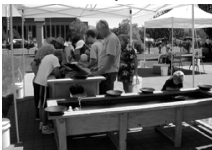
One of the projects of the Coin Show that has found favor with the younger crowd was the gold panning with real gold dust. Everyone took their gold gold home in a vial filled with water.