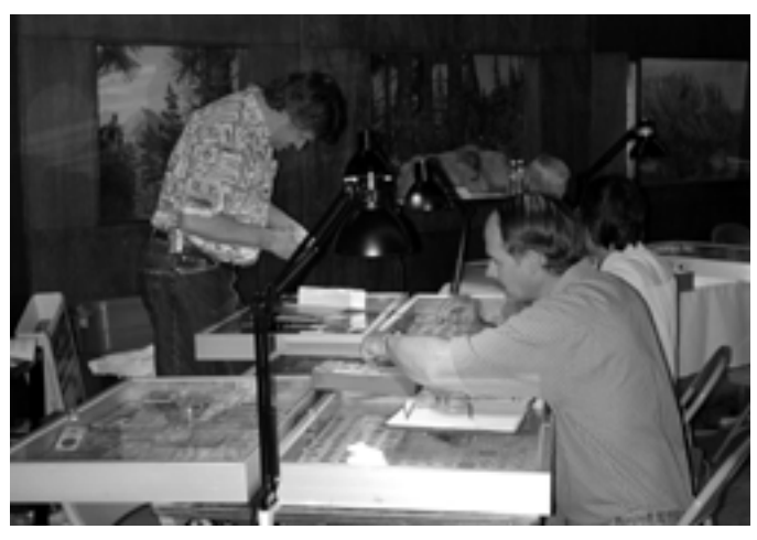
During the two days of the show, the dealers were kept busy with buyers and sellers of coins.