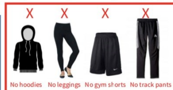
No hoodies No leggings No gym shorts No track pants