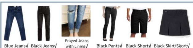
Blue Jeans✓ Black Jeans✓ Frayed Jeans with Lining✓ Black Pants✓ Black Short✓ Black Skirt/Skorty✓

Black bottoms are popular! Don't risk losing this privilege by wearing athletic wear/leggings.