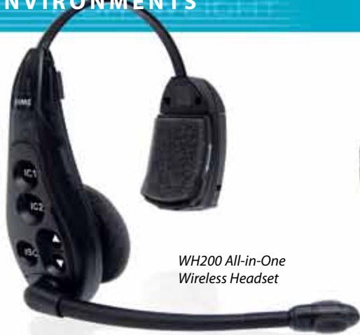
WH200 All-in-One Wireless Headset