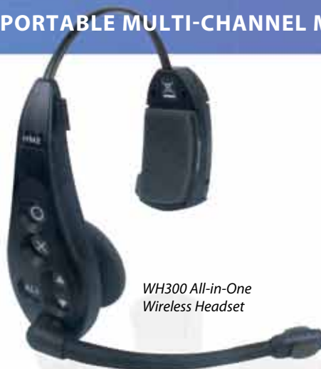
WH300 All-in-One Wireless Headset

PORTABLE MULTI-CHANNEL MOBILE COMMUNICATION