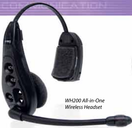
WH200 All-in-One Wireless Headset