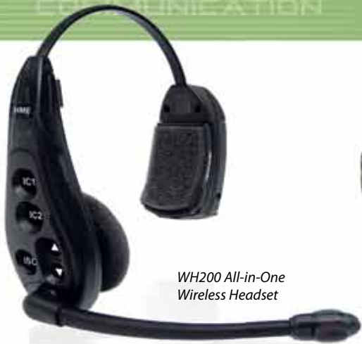
WH200 All-in-One Wireless Headset