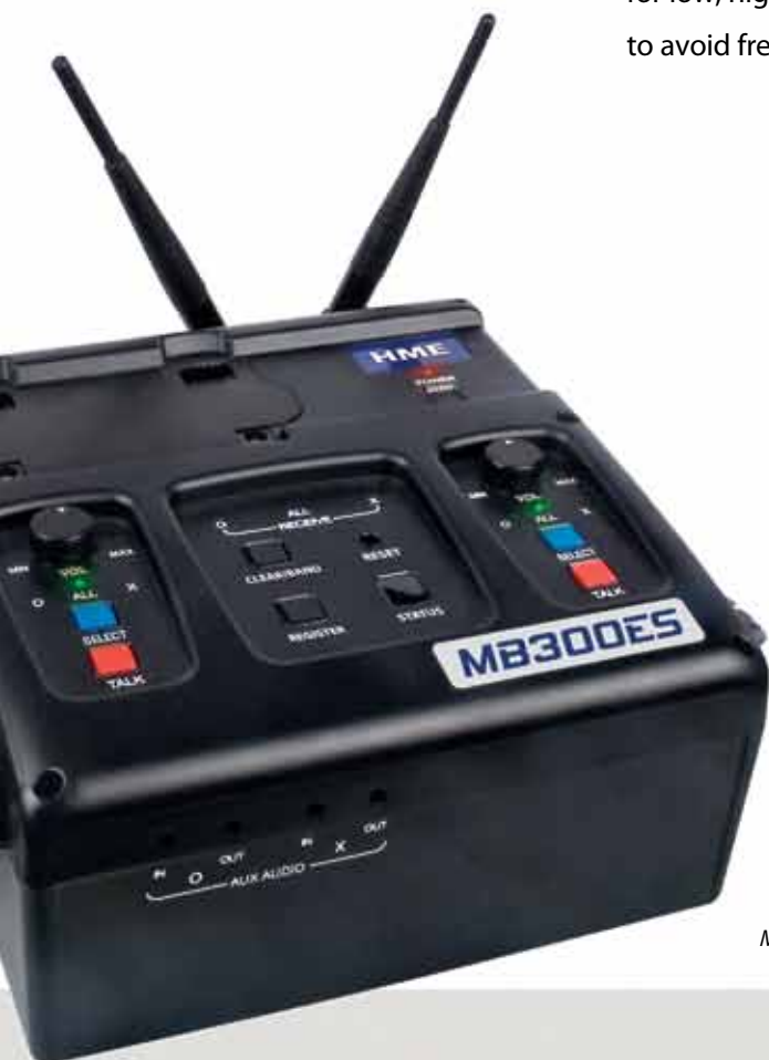
MB300ES Base Station

Frequency range can be selected for low, high or full band only, to avoid frequency conflicts.