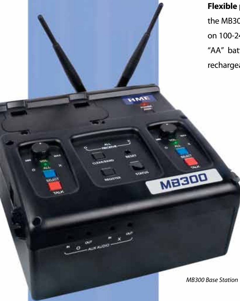
MB300 Base Station

Auxiliary Input and Output ten-pin terminal strip connector for easy connection to four-wire intercom systems. External interface required to connect into two-wire systems.