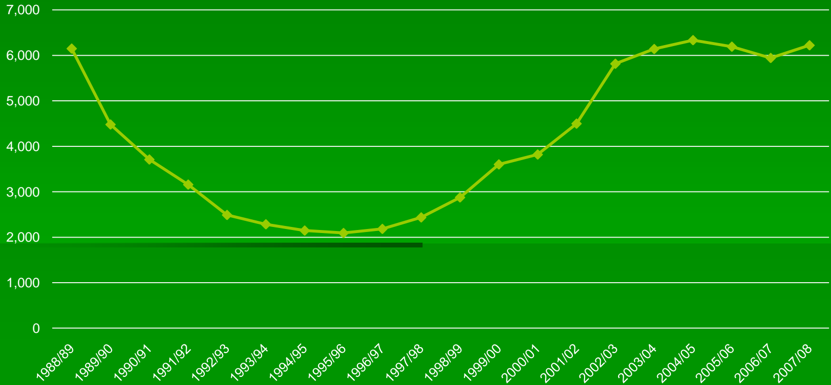
Nigeria: Students in the United States