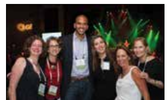
Photos from 2013 PCMA Capital Chapter & Chesapeake Chapter Reception, and Party With a Purpose