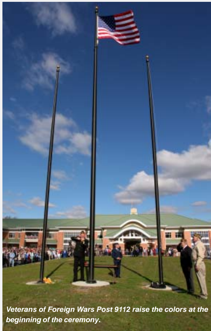
Veterans of Foreign Wars Post 9112 raise the colors at the beginning of the ceremony.

The new wing can house 300 residents and replaces three older structures. It features semi-private rooms with their own bath rooms, internet connectivity, and a bi-level courtyard. The new Home can accommodate a wide range of residents needs and also contains a wing dedicated to independent living – the first for a state Veteran Home. The new home also boasts a chapel with stained glass, a library and a full range of amenities including a barbershop, a beauty salon, a dental clinic, vision and auditory offices, private doctor offices, a complete physical therapy room and a snack shop.