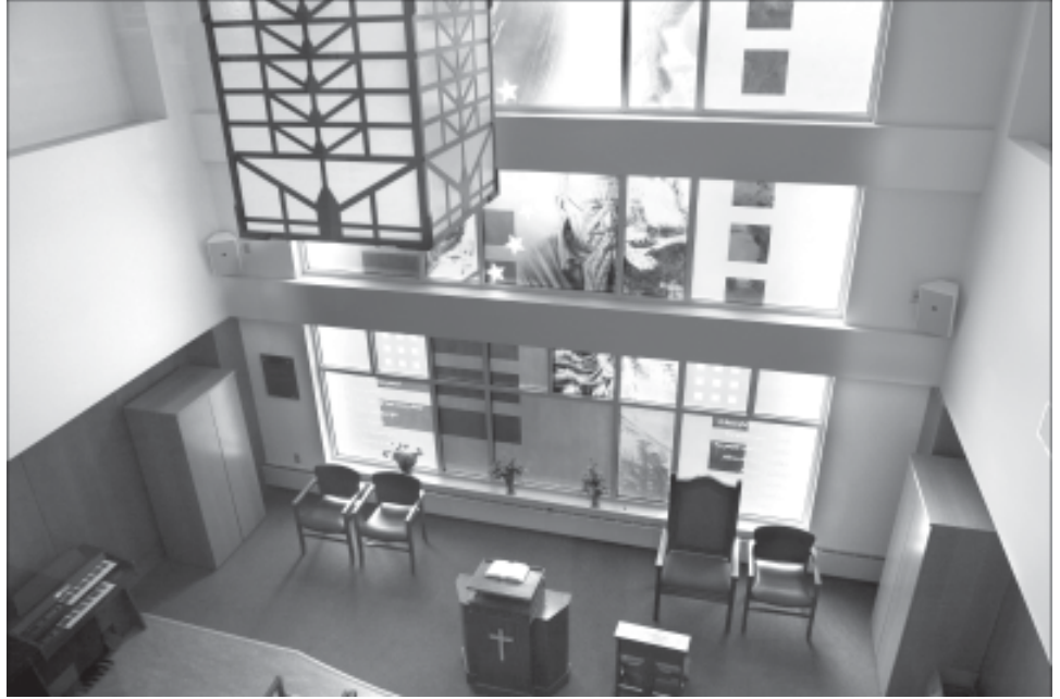
The chapel in the new wing at the Vineland Veterans Memorial Home.

All of New Jersey's State Veteran Homes can accommodate a full spectrum of residents nursing needs. Additionally, each Veteran Home can boast of a full range of amenities including chapels, libraries, barbershops, beauty salons, clinical offices, private examination rooms, complete physical therapy services, a snack shops and much more. The new Vineland facility also contains a wing dedicated to independent living – the first for a state Veteran Home.