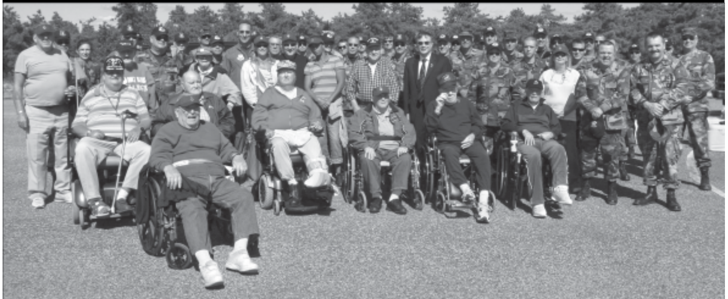
Vineland Veterans Memorial Home residents visited the Warren Grove Training Range Sept. 21 for a barbecue and airshow